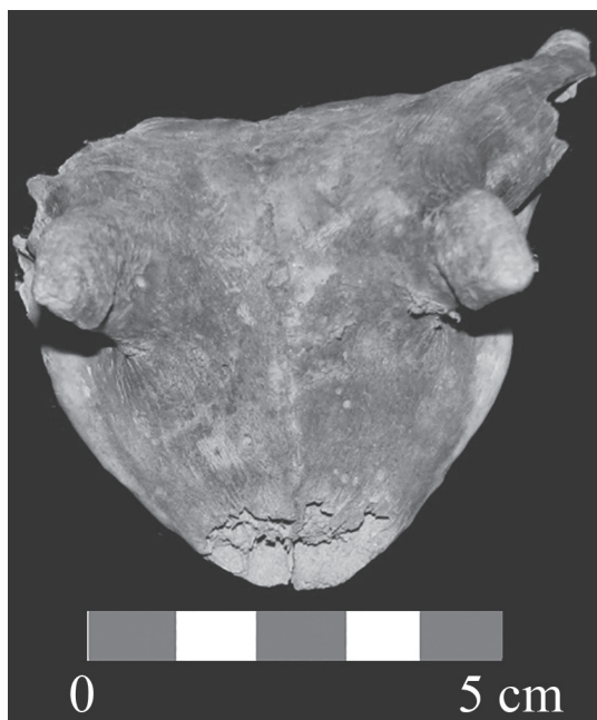
Fig. 2: Pogonias cromis from Matamoros, Tamaulipas, México. Ventral view of the lower pharyngeal jaw. Its length along outer margins is 83.79 mm Visual scale 5 cm.