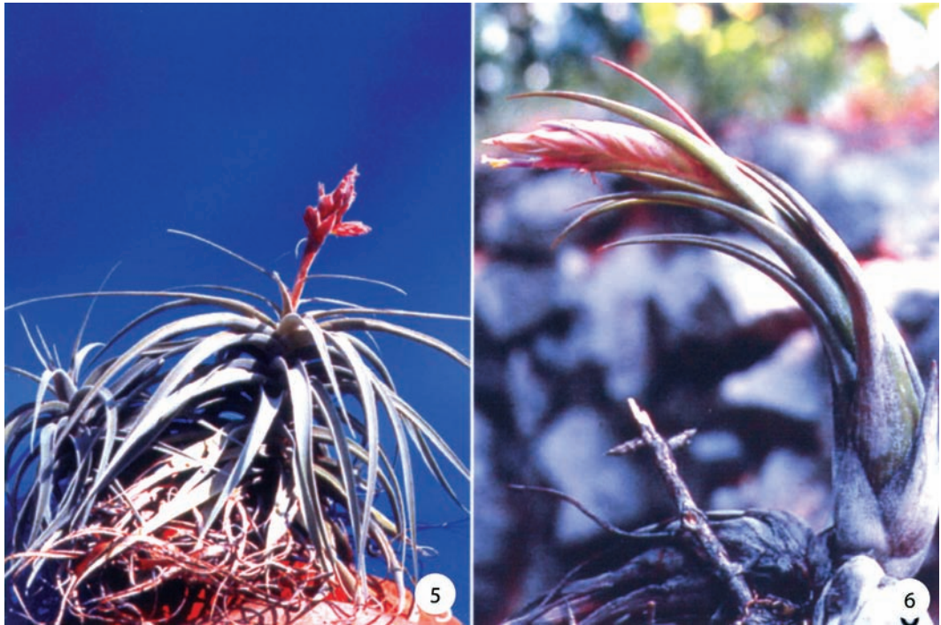
Fig. 5. Tillandsia purpurea : highly expanded type. Fig. 6. Tillandsia circinnatoides : utmostly expanded type.

After the staining we centrifugated again the material and we mounted it on slides. The observations were done with a Leitz Orthoplan light microscope. During the observations, for each species, we took about 40 photographs of trichomes, randomly chosen. Photographs were taken with an Orthomat Leitz camera. Afterwards we developed prints from negatives with final magnification of 100,8 x or 252 x.