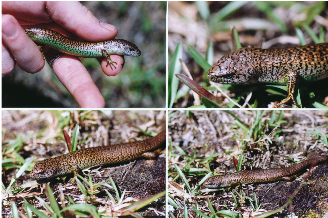
Fig. 3. Celestus orobius from Costa Rica: Provincia de San José: Parque Nacional de Chirripó Grande, 1 800 m.