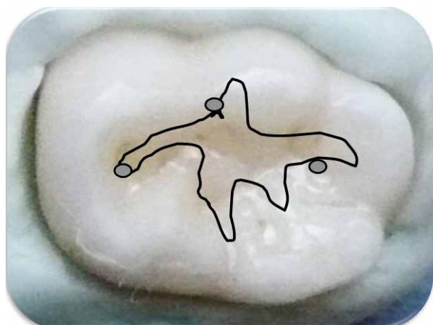
Figure 1. Areas of the molars upon which the measurements were performed.