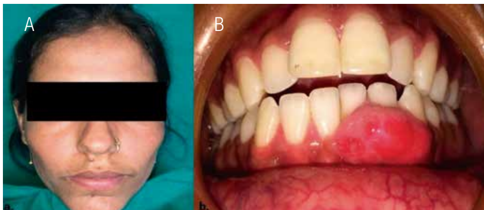
Figure 1. Extra oral photograph with no facial asymmetry (1A) and intraoral photograph of the growth (1B).

was sent for histopathological examination, which showed parakeratinized stratified squamous epithelium of variable thickness with evidence of ulceration in some areas. The underlying dense fibrous connective tissue shows varying degrees of cellularity along with foci of mineralization. The hard tissue component showed basophillic acellular spherules. There was presence of focal chronic inflammatory cell infiltrate and granulation tissue formation in some areas. These features were suggestive of peripheral cemento-ossifying fibroma. (Figure 4) In the present case, after excision of the lesion, all the remnant of the lesion was removed and thorough debridement was done. Capsule amoxicillin (500mg), tablet metronidazole (400mg) and tablet ibuprofen (400mg) were prescribed to the patient thrice daily for five day postoperatively, to relieve the pain and to prevent secondary infection Following this, close monitoring was done after 10 days, 1 month, 3 months and 6 months and no recurrence was observed. The surgical site appeared to be healing well. The patient was asymptomatic, aesthetically sound and satisfied with results on follow up.