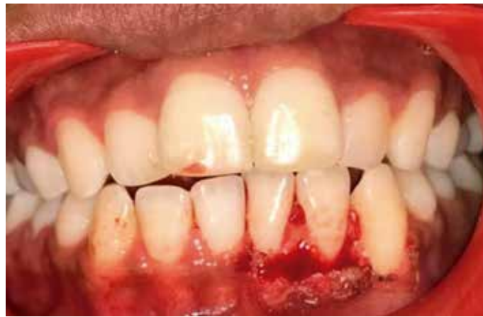
Figure 3. Intra oral photograph of the same region just after the excision of the lesion.