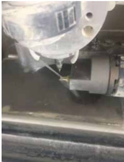
Figure 1. Closer view of dentin fragment being milled in CAD-CAM milling machine to generate dentin post.

The SEM images of sterilized and non-sterilized dentin of the human and bovine teeth were shown in Fig.4. Notable variations were found among the Cnt, Aut and Rad groups.