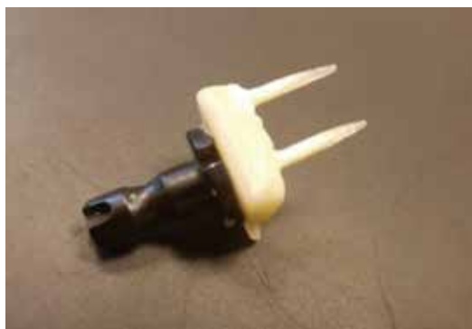
Figure 2. A milled dentin post specimen.