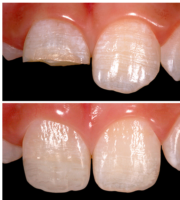
Figure 1. Before and after (4 years of control) of an anterior esthetic restoration without bevel preparation.

for the development of a conservative treatment by the dentist resulted in the development of different clinical protocols. Moreover, contemporary restorative dentistry advocates minimally invasive conservative procedures to prevent unnecessary removal of healthy dental structure during the operative process. Evidence suggests that the functional and esthetic restoration of Class IV fractures can be accomplished without removing healthy tooth tissue.