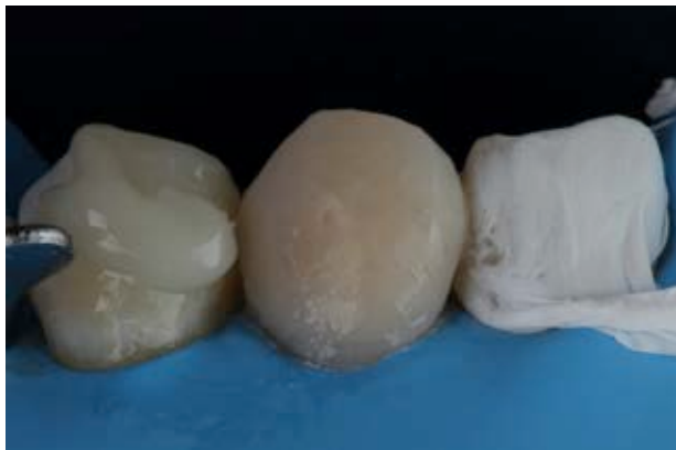
Figure 6. Cementation of the indirect composite resin fragment.