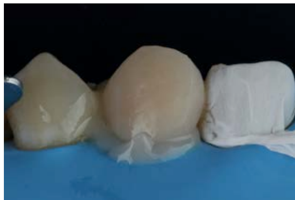
Figure 5. Cementation of the veneer.