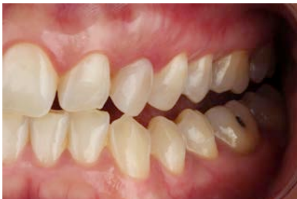
Figure 7. One-year follow up. Clinical appearance in function.