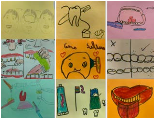
Figure 3. Drawings made by participants after immersion in VR.