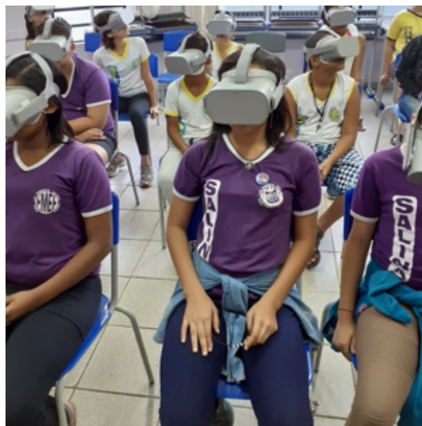
Figure 1. Pupils using VR glasses and receiving oral hygiene information.

virtual reality glasses (Oculus Go, Facebook Technologies, Auburn, USA) were purchased by SESC Araraquara and used in the study. Participants were encouraged to write or make drawings related to the activity. After an interval of one week, the participants answered the oral hygiene questionnaire again.