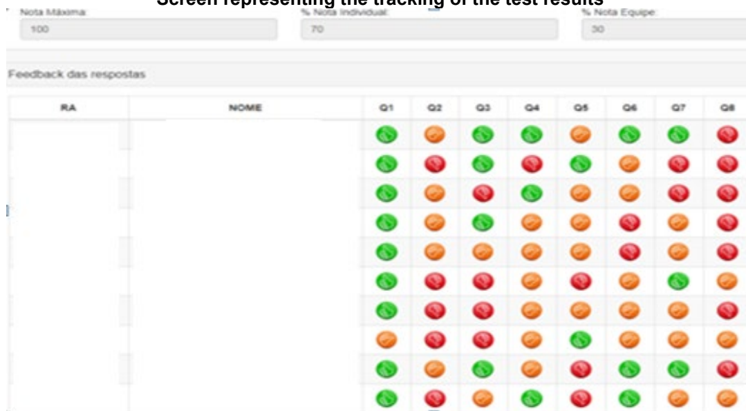
Figure 3. Screen representing the tracking of the test results