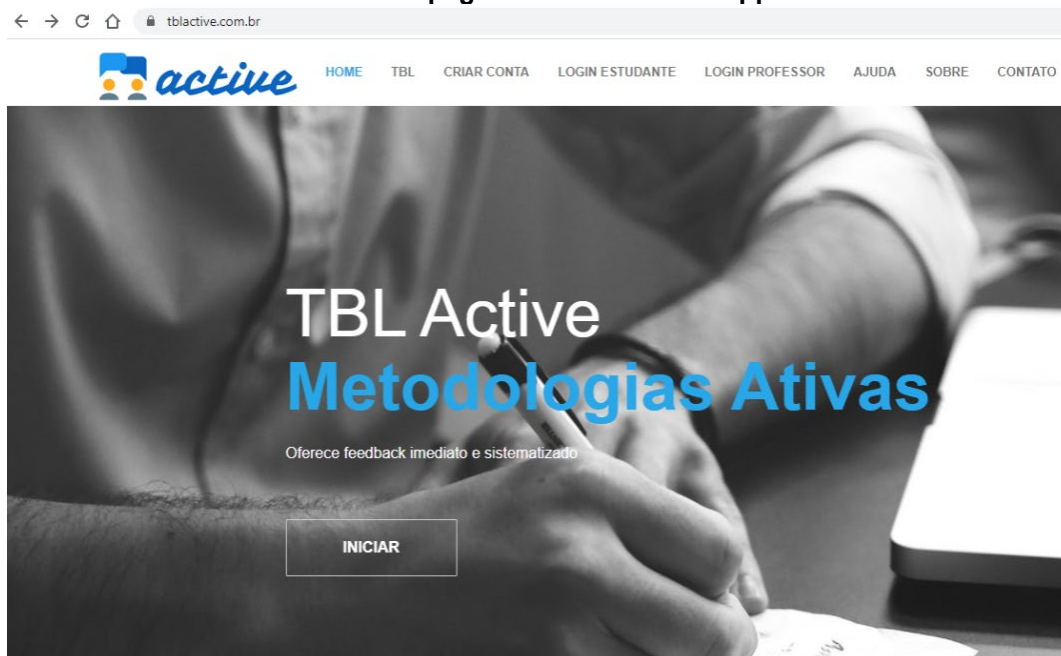
Figure 2. The main page of the TBL Active app.