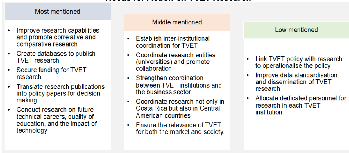
Figure 2 Needs for Action on TVET Research

So, what conclusions can now be drawn about future fields of action to strengthen TVET research in Costa Rica? Based on their frequency in interviewees' statements, the following actions in Figure 2 are relevant to improving TVET research and its institutionalisation.