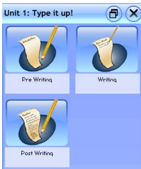
Snapshot of Type It Up