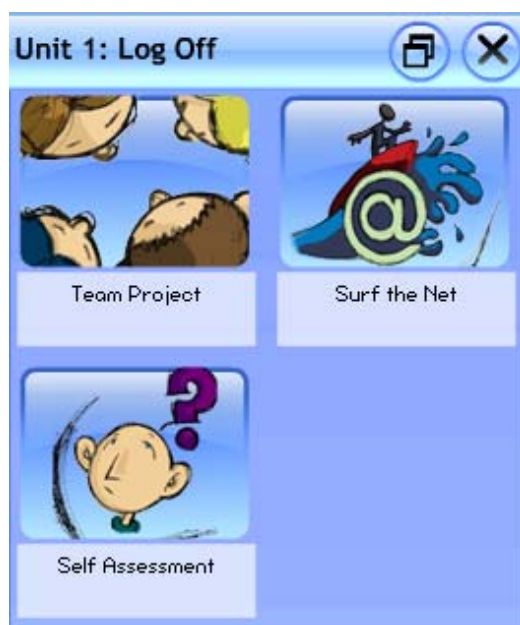
Snapshot of Log Off

reflection on how students have progressed in the language and how these new skills and strategies will help them in their everyday life activities.