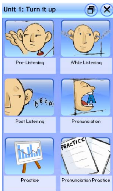
Snapshot of Turn It Up