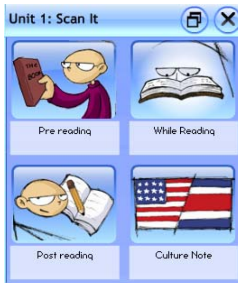
Snapshot of Scan It