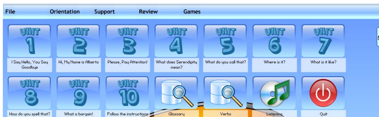
Cyberlab snapshot for Seventh Graders

CyberL@b is a digital platform that incorporates Web-based learning as a means for facilitating the practice of English as a foreign language. This integrated cross-curriculum topic-based program allows on-line users to grow in the English language by immersing learners into the topics found in the National English Curriculum of the Ministry of Education with controlled, semi-controlled and communicative tasks (see http://lemo.le.ucr.ac.cr ). As students work with CyberL@b, they are led towards critical thinking, problem-solving experiences, and hands-on projects, providing authenticity and meaningfulness to learning English. The uniqueness of its components describes its capabilities. (See picture below)