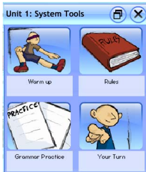
Snapshot of System Tools