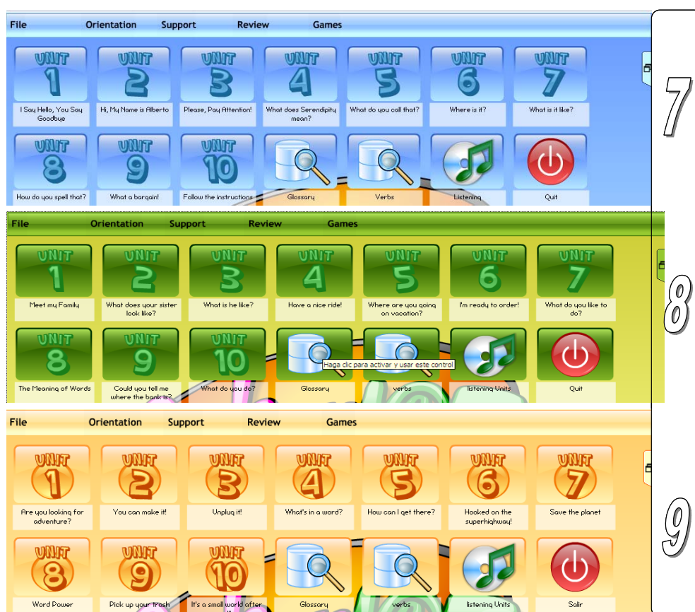
Snapshot of 7 th , 8 th , and 9 th grade platforms