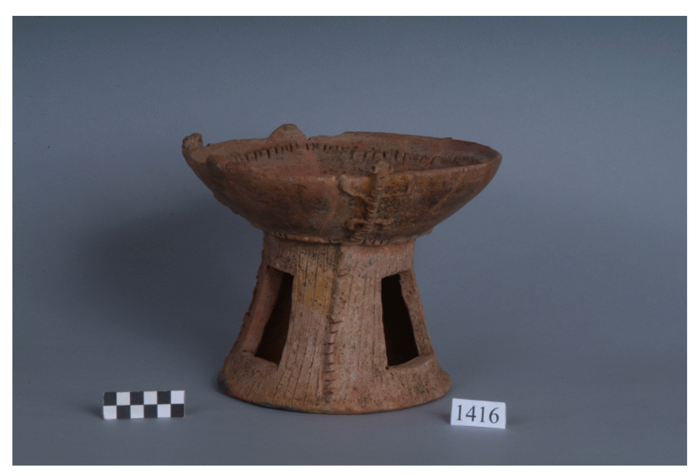
Figure 5: Potosí censer base with gecko-like creature adorning the rim.

The third observation is variation in the use of cut-outs and vent styles and, in some cases, the complete lack of a ventilation system. The most notable use of the vent hole as a mechanism for intensifying ritual experience can be seen with the fantastic crocodile version of Potosí (see Figure 1), where smoke is channelled out through the elaborately modelled crocodile snout. Incense, by definition, is used for the smell provided by the organic material, thus I feel that the crocodile smoke reference may be somewhat misguided. These vents may be more related to artistic, or most likely practical reasoning such as ensuring heat can be released from the ceramic during firing in manufacture. While a mythical smoking crocodile creates a fantastic image in our minds, the lack of consistency in location of vents or presence of vents suggests to me that this was not a purposeful manufacturing element by the artisans, but rather an integrated technical requirement. Furthermore, it is difficult to determine what type of environment the censers were used in; dry season versus wet season or general geographical location relative to environmental elements may have affected smoke patterns. I have noticed three general patterns to the cut-outs and venting style present on the Potosí censer base: Figure 5 demonstrates the large artistic rectangular cut-outs, Figure 13