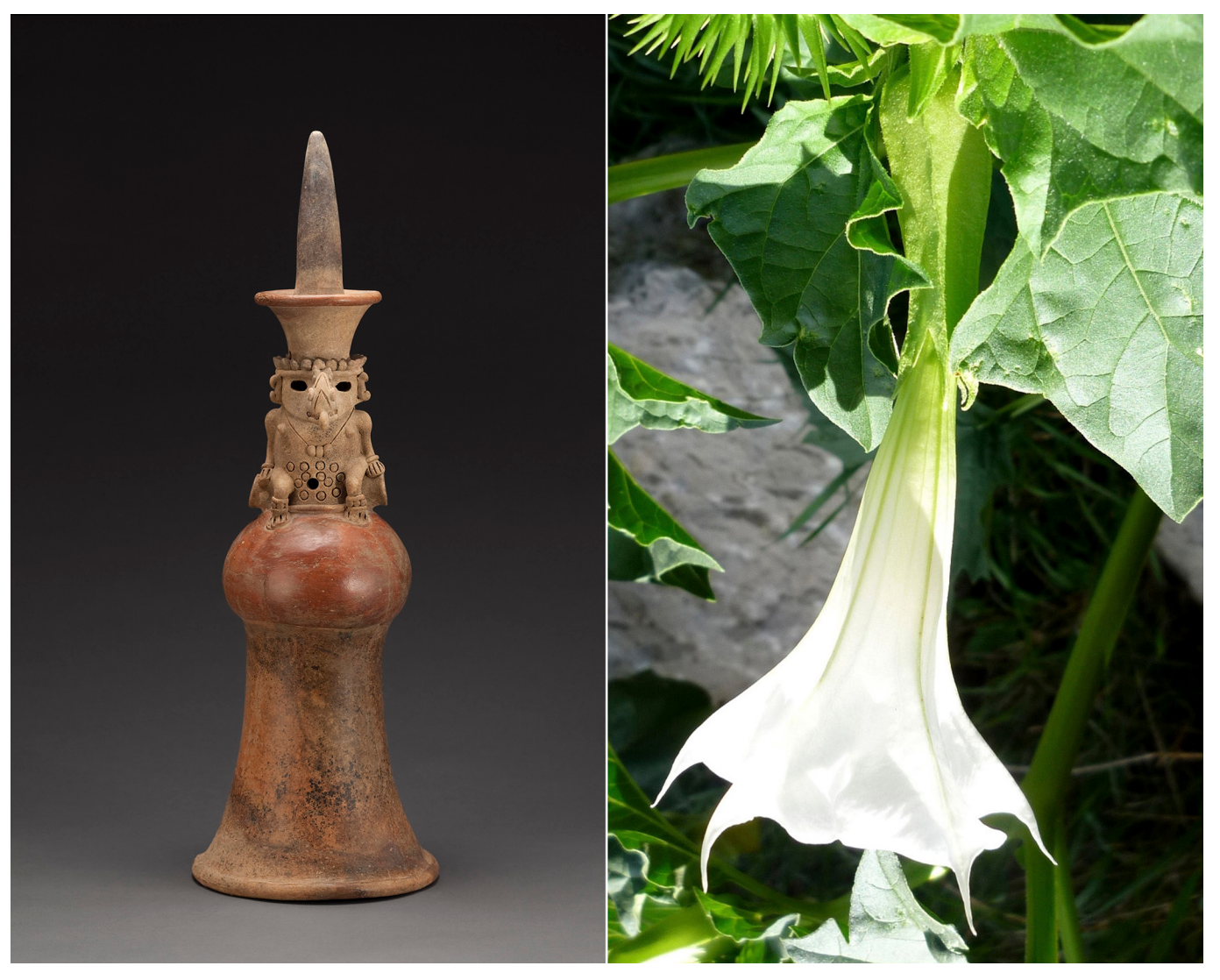
Figure 3: (left) Potosi censer lid argued to represent an upside down Datura stramonium flower (see Wingfield 2009:232, 661). Incense Burner Lid with Seated Figure, AD 500—800 Greater Nicoya, Nicaragua, Costa Rica Denver Art Museum Collection: Gift of Frederick and Jan Mayer, 1995.437; (right) Flower of Datura stramonium.

fruit (or seed?) is represented on these censers for two reasons. First, it is currently difficult to deduce if there is an association between what is burned inside the vessel and what is represented on the outside, and second, many seed pods and fruits have a rather generic oval shape. Based on the small number of samples under review, it is currently difficult to determine the exact fruit/seed being shown. However, in the case of Figure 4, I believe a cacao fruit pod is being represented as the effigy.