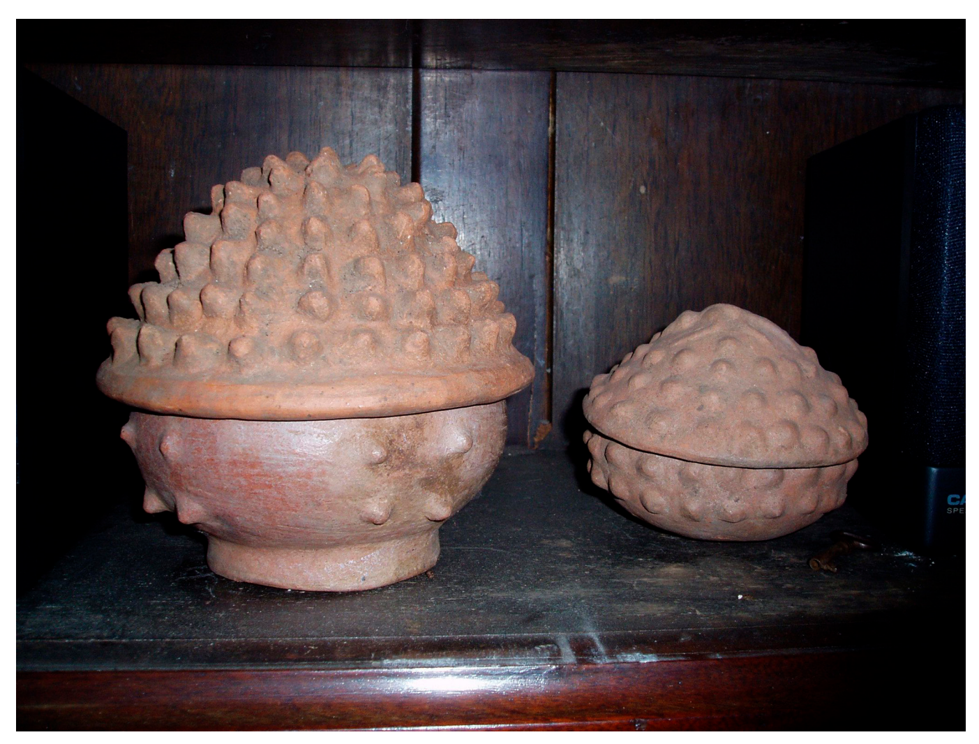
Figure 16: Potosí censers from the Arguello private collection, Nicaragua.

As previously mentioned, the intention in presenting this hypothesis and model is for re-evaluation using multiple lines of evidence, in this case building toward a future synthesis of iconographic and ethnobotanical analyses to expand our understanding of these important ceramics. Previous studies have tended to remove symbols from their practical contexts and physical world representations; they haven then been emicly interpreted in artistic manners. I hope that future research can begin to tie the physical realm in which these communities lived to their artistic interpretations in the ceramic record. We must focus more strongly on multidisciplinary research if we are to better understand what is represented on these ceramics and how they were used.