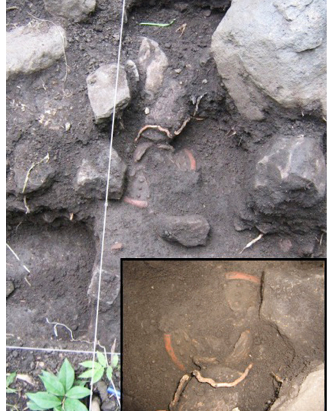
Figure 2: Santos variety Potosi Applique from Locus 2 of El Rayo, Nicaragua, inset photo is a close up of the ceramic.