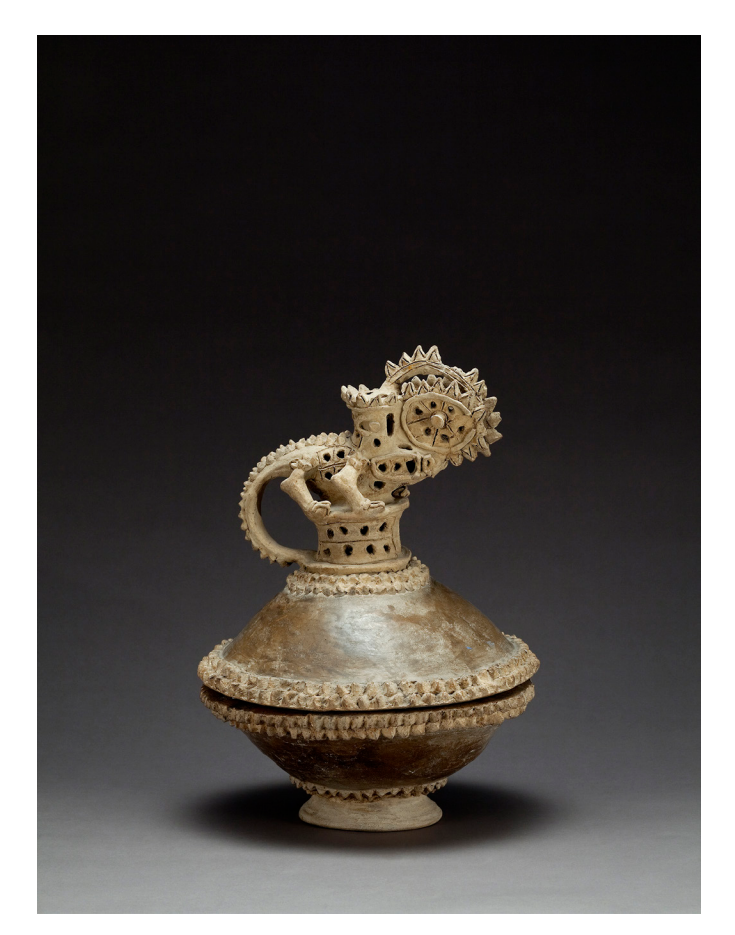
Figure 10 : Potosí censer with banding focused on upper and lower edges. Incense Burner With Fantastic Reptile, AD 500-800 Greater Nicoya, Nicaragua, Costa Rica Denver Art Museum: Collection of Frederick and Jan Mayer

and ceremony took place currently makes this question very difficult to answer. Figure 14 shows a small circular vent similar to a censer from Copan (see Hough [1912: Figure 3]). Worth mentioning is the fact that the vessel used by Hough (1912: Figure 3) in discussion of transportation methods also exhibits pointy applique pellets, although the vessel he demonstrates is from the site of Copan, Honduras. The spikes have also been discussed as a grip to hold the vessel, and disperse heat away to prevent the carrier's hands from burning (Deal, 1982; Houston, 2014). This is an interesting idea, but in the case of Potosí from Greater Nicoya, the variation seen in applique design suggests this may not have been the intention of the applique. In many cases, however, it seems that vent holes on the effigies or closed parts of the censers are simply designed to prevent the ceramics from breaking or exploding during the firing process.