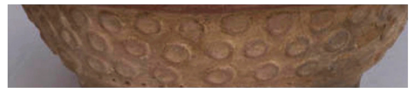
Figure 8: Potosí censer raised circular 'O' pellet detail.

shows a medium sized triangular cut-out, and Figure 15 shows a delicate cross or plus sign style of vent next to a small circular vent.