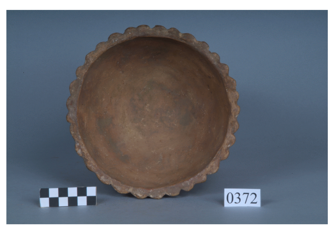
Figure 11: Bird's eye view of Potosí censer base with scalloped rim profile.

The applique pellets on censers from other geographic locations has been compared to tree bark, particularly the Ceiba tree, due to the obvious visual similarities (for example Dreiss and Greehill [2008]; Houston [2014]; Kidder [1950]; Kurnick [2009]; Pennacchio, Jefferson, and Havens [2010]). Censer vessel forms from the Condega Museum in northern Nicaragua are reminiscent of the spikey vessels found in northern Central America, which are said to resemble Ceiba bark. In some cases, this is perhaps what is being mimicked on the Potosí surface, especially in cases where the pellets are uniform across the surface and of a taller, pointier nature. In ritual ceremony these specific Potosí vessels might act as a 'tree' or axis mundi connecting the physical realm to the spiritual one either below or above the surface of the earth depending on the ritual (Houston [2014]; Kurnick [2009]). I question if the wide variation in stylistic pellet renderings across the Potosí varieties has blurred our ability to recognize this as a potential option in Greater Nicoya. Figure 5 demonstrates linear incising reminiscent of the bark striations present on tree trunks, in addition to the general tree trunk form with incense perhaps representing the center of the tree. The lack of consistent design in the shape of the pellets and vessels that have non-uniform pellet designs, however, raise new