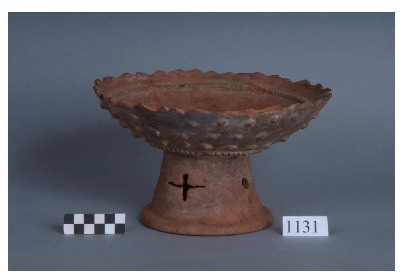
Figure 14: Smaller, more delicate cross-shaped ('+') venting style on Potosí censer base.

1980; Bransford, 1881; Haberland, 1992), in addition to the production of cacao, provides further support of cacao seed representation on the body. I believe that there was a greater knowledge base of plant biology than what we as archaeologists currently allow for. Seeds carry knowledge, food, and medicine among other things, and I believe that there was a greater respect and desire to preserve the sacred element of the biological world in which people lived. Bransford (1881) mentions the presence of seeds in addition to coffee and beans as burial offerings on Ometepe. Iconography displaying seeds on ceramic vessels could be the ultimate form of respect to that plant, reinforcement of its important place in the ritual economy of life, alongside the addition of those seeds in burial offerings to individuals, perhaps needed to start their new life in another world.