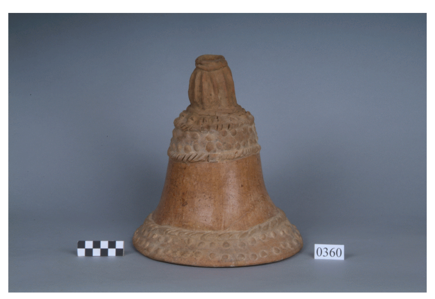
Figure 4: Potosí censer lid with seed-form applique pellets and fruit pod effigy, possibly representing cacao.

incense 'act' as the pollen. While we are unable to see pollen with the naked eye, more than 100,000 different species take part in pollination (Abrol, 2012), and local populations would have undoubtedly observed the local animals, birds, butterflies, bees, and/or insects taking part in the process. This reasoning may provide support for why the exterior surface lacks the applique pellets, as the exterior portion of a flower is general plain aside from the attachment of the sepal to the peduncle. Flowers also have some association to Tojolabal type spiked vessels manufactured in the Maya region, where people used a traditional spiked pedestal based vessel "as an offering receptacle for flowers" (Deal, 1982, p. 616). The Datura flower, for example, is represented on one version of Papagayo: Fonseca variety bowls (see Figure 12) manufactured in the Granada City area (see Dennett [2016]), and which have traditionally been thought of as a pinwheel, perhaps indicating these were similarly used as flower receptacles given the shallow depth of the Papagayo bowl.