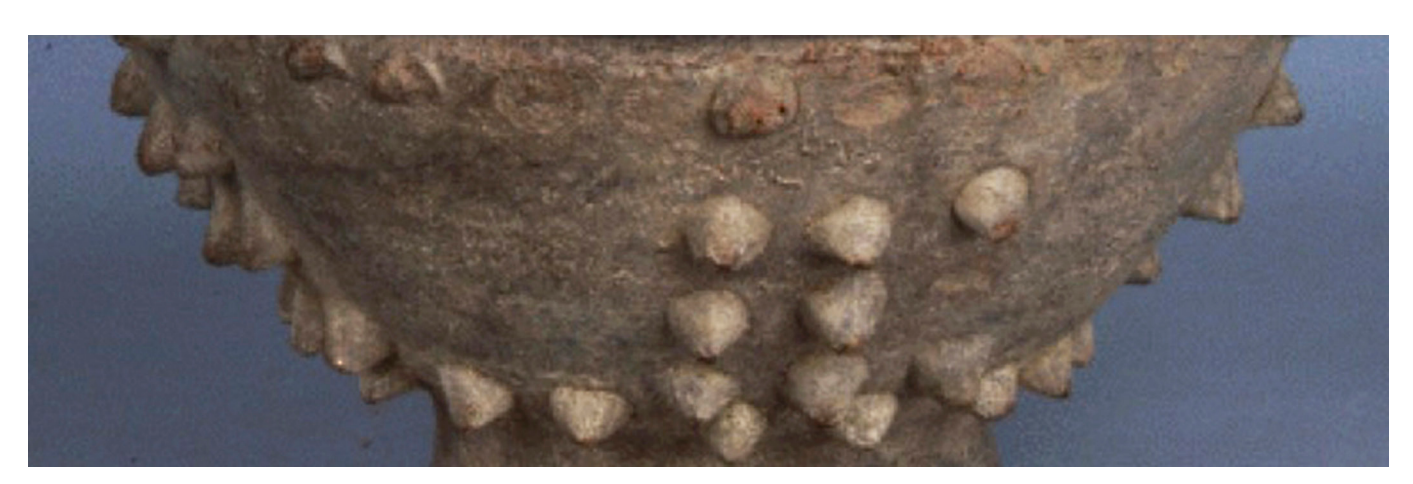
Figure 6: Potosí censer spiked pellet detail.