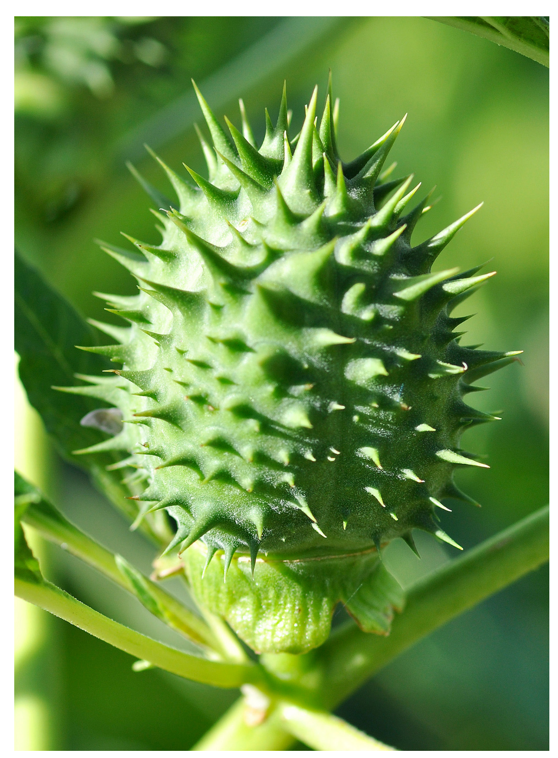
Figure 15 : Datura fruit pod. Photograph by Amada44 (2010), reproduced under the Creative Commons Attribution-Share Alike 3.0 Unported license.