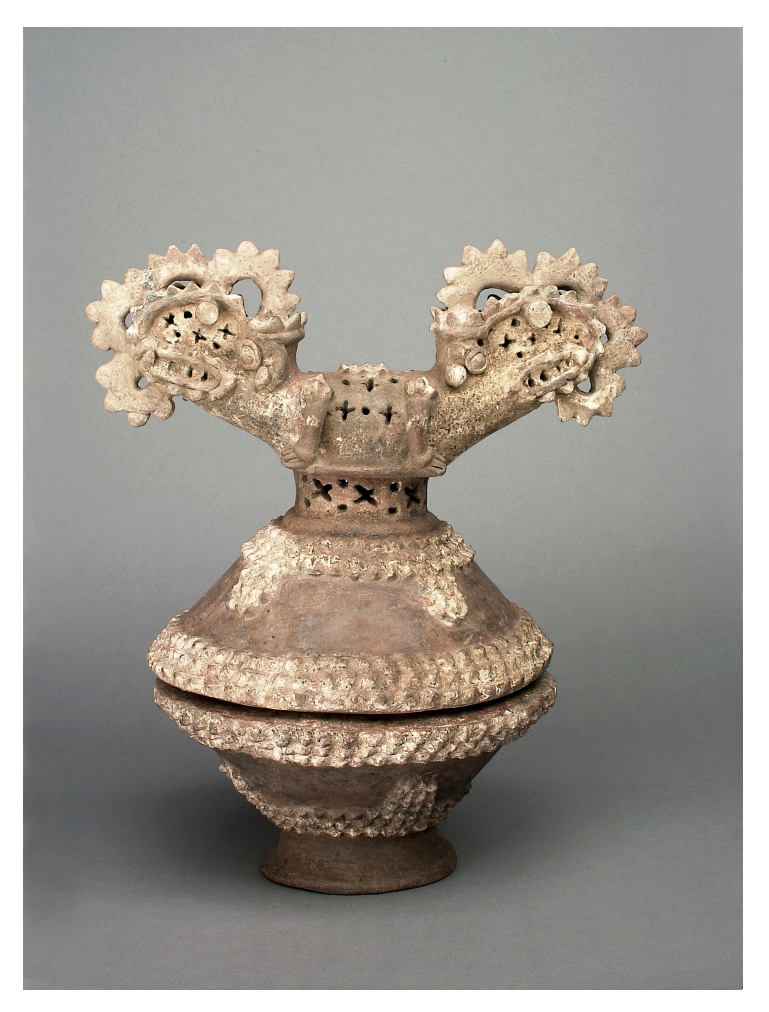
Figure 1: Potosí Applique with crocodile effigy. Visible cluster applique as well as the rim banding. Double-headed Reptile Incense Burner, AD 500-800 Greater Nicoya, Nicaragua, Costa Rica Denver Art Museum Collection: Gift of Frederick and Jan Mayer, 1993.592A-B

as far as coastal regions of Ecuador and the Chorrera culture (950-350 BC). In recent years, analysis of Potosí Applique in general has become somewhat stagnant, perhaps because the vessel's function is one of the most obvious in Greater Nicoya. As the most frequently published and republished images of Potosí Applique often show a crocodile and/or volcano effigy (see Figure 1), there has seemed to be no interest in further questioning the role of the applique designs. The "standardized and limited set of decorative features" (Dennett, 2016, p. 300), in addition to the lack of real understanding of the position of Potosí Applique in the broader ceramic assemblage across time and place has resulted in regurgitation by scholars of the same poignant design elements at the expense of many others that exist within the type, resulting in a lack of further exploration of the ceramic type.