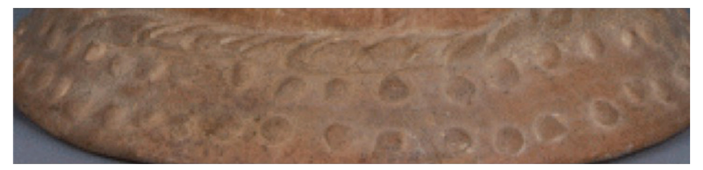
Figure 7: Potosí censer rounded 'lump' pellet detail.