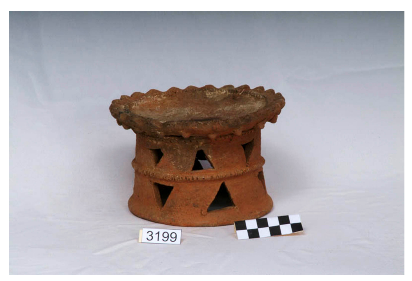
Figure 13: Triangular cut-outs on Potosí censer base.