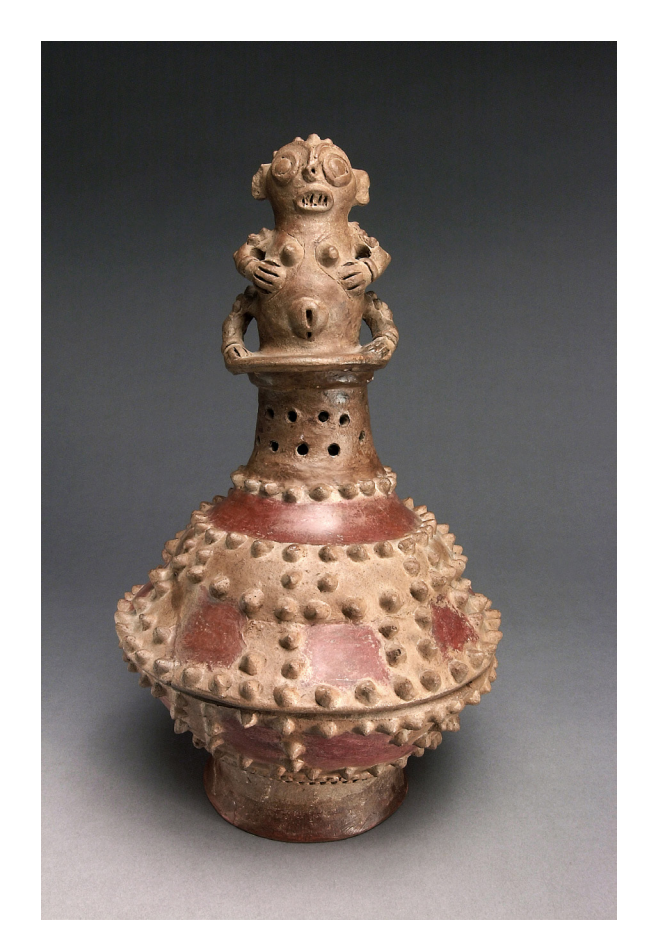
Figure 9: Potosí censer applique banding with vertical clusters. Lidded Incense Burner with Female Figure, AD 500-800 Greater Nicoya, Nicaragua, Costa Rica Denver Art Museum Collection: Gift of Frederick and Jan Mayer, 1995.699A-B

vessels seen in many collections I have reviewed. Important to note, Figure 4 contains an incised 'x' on the upper region of applique pellets though it does not penetrate through the vessel to create a vent. It is possible that specific vessels with the cross and/or 'x' held higher power when combined with other censers. I have discussed elsewhere (see Dennett and Platz [2017b]) the symbolic relationship to the creator couple concepts from the broader Zapotec religious cult. I hypothesize that this concept may have been drawn upon during ritual ceremonies using the censers to increase the power of the ritual and perhaps the combination of incense used.