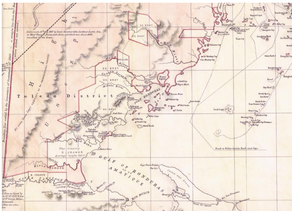
USHER'S MAP (1891) SHOWING PRIVATE PROPERTIES IN SOUTHERN BELIZE

Note: Note that the interior of the Toledo District is marked ‘unexplored’. As in the 1885 map, representation of the mountains of the mountains – drawn “As seen from Cayes” (the coast) – is inconsistent with local topography.