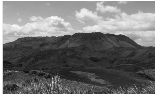
Fig. 4: La Yeguada volcanic complex, view looking to the southwest. Cerro Corero is the most prominent peak from this view.

Seven samples were selected for ^{40}\text{Ar}/^{39}\text{Ar} geochronology and processed at the University of Wisconsin, Madison in the Rare Gas Geochronology Laboratory. Units to be dated were chosen to span the age range of the complex, focusing on the youngest (Media Luna), the main dome, and adjacent deposits. The seven samples are; Media Luna, Castillo, Corero, Novillo, Picacho, the El Satro Pyroclastic Flow, and Mano de Pilon. However, the plagioclase in the Mano de Pilon sample was too altered to be dated, thus only six samples were actually processed.