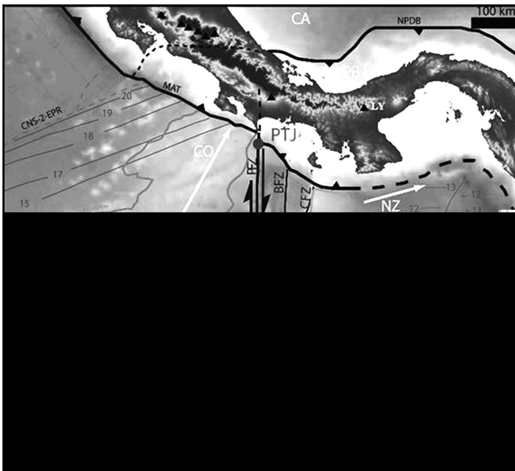
Figure 3. Regional digital elevation model of southern Central America. (Figure used with permission from K. Morell, from Morell et al (2008)). Black triangle on the right (LY) is La Yeguada volcanic complex. Panama Triple Junction (PTJ, red dot) at the intersection of the Cocos (CO), Nazca (NZ) and Panama block (PB), part of the Caribbean (CA) plates. PFZ = Panama Fracture Zone, NPDB = North Panama Deformed Belt, MAT = Middle America Trench. White arrows indicate plate motion vectors relative to a fixed Caribbean plate. Black triangles denote active volcanoes. Map of identified magnetic anomalies on lower plate based on data by Barckhausen et al. (2001), Lonsdale and Klitgord (1978), Lonsdale (2005), Lowrie et al. (1979), and modified after MacMillan et al. (2004). Numbers show age in millions of years based on the chron time scale of Cande and Kent (1995). BFZ = Balboa Fracture Zone, CFZ = Coiba Fracture Zone, CR = Coiba Ridge, MRi = Malpelo Ridge, CNS-2-EPR = boundary between crust originated at Galapagos Hot Spot (CNS-2, south of boundary) and EPR (East Pacific Rise) crust (north of boundary). Bathymetry supplied by the USGS GTOPO30 dataset, and topography by NASA SRTM-3 90-m DEM. Inset. Plate vector diagram after Sitchler et al. (in press), relating Cocos, Nazca, Caribbean plates, and Panama Block. Solid lines denote relative plate velocity vectors based on velocity model NNR-NUVEL-1B derived from Bird (2003), DeMets et al. (1990), Shuanggen and Zhu (2004), and Silver et al. (1990). Bold dashed lines represent the location of the Middle America Trench, and Panama Fracture Zone, respectively. The intersection of these represents the Panama Triple Junction, which migrates to the SE along the Middle America Trench with respect to a fixed Panama Block at a rate of approx 55 mm/yr (red dashed line). Panama Block–Nazca (PB-NZ) and Panama Block–Cocos (PB-CO) convergence are shown as dotted gray lines orthogonal to the Middle America Trench. Rates are shown in mm/yr.)