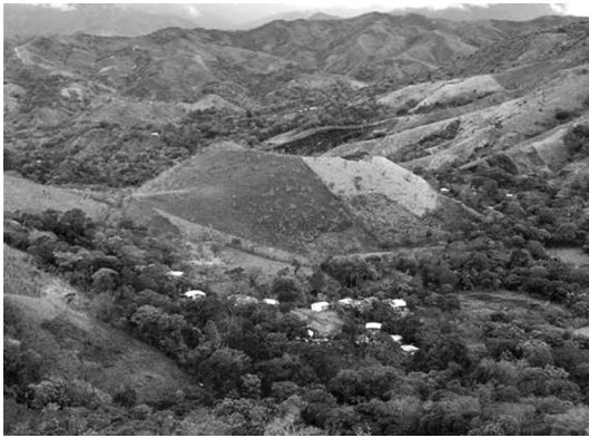
Fig. 5: Media Luna cinder cone; view of east side, opening from last eruption is on the opposite, west side. The village of Media Luna in foreground.

Petrographic inspection of Cerro Mano de Pilon and Cerro Picacho revealed that each sample is extensively altered, both containing degraded amphibole and biotite, possibly devitrified glass, along with quartz and plagioclase. Picacho ( 4.83 \pm 0.16 Ma) is a dacite, and the deeply weathered Mano de Pilon (undated) is either an andesite or dacite. Richerson (1990) calls Mano de Pilon a rhyodacitic pyroclastic deposit and notes that it appears to be Miocene because it is overlain by the El Satro Pyroclastic Flow (ESPF). Richerson (1990) noted that it is likely that as the younger peaks came up through the older ESPF, some of the ESPF unit was transported and now sits on top of the younger dome rocks. Within the Castillo unit (Tca) two samples are clearly welded tuffs (Castillo 5b [KK040208-4] and Novillo [KK060208-3]), however there is no evidence to support that these are blocks of the ESPF. These welded tuff samples have well-preserved pyroclastic flow features and are more likely separate events, which are commonly associated with andesitic and dacitic lava flows (Cas & Wright, 1988). The Knutson sample of Mano de Pilon is not a welded tuff, and therefore the Richerson sample may be another example of a pyroclastic flow within the unit.