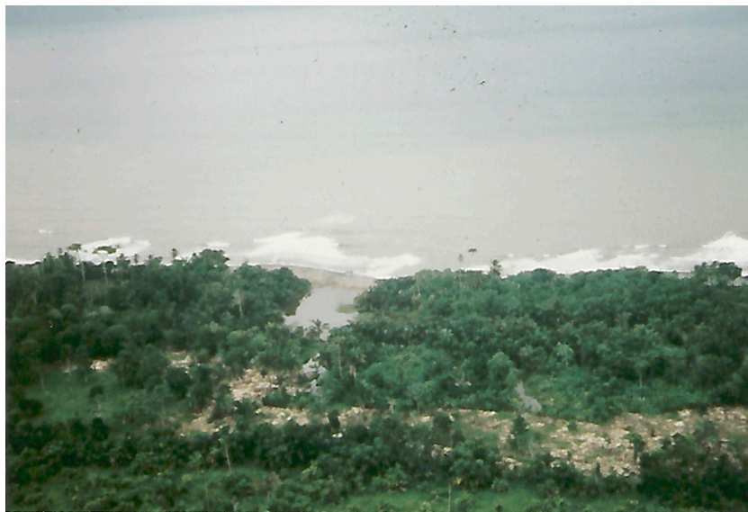
Fig. 5: Near vertical air photograph of an area inundated by the tsunami between the mouth of the Rio Changuinola and Tiribibi Point, Panama (site 16, Fig. 1). Note the onshore flooding in the center of the photograph and zone of brown vegetation in the lower portion of the photograph.