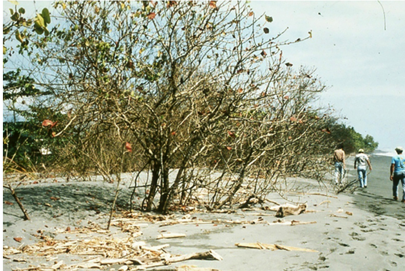
Fig. 6: Tsunami sand deposits on the beach at the San-San Natural Refuge, Panama (site 13, Fig. 1).