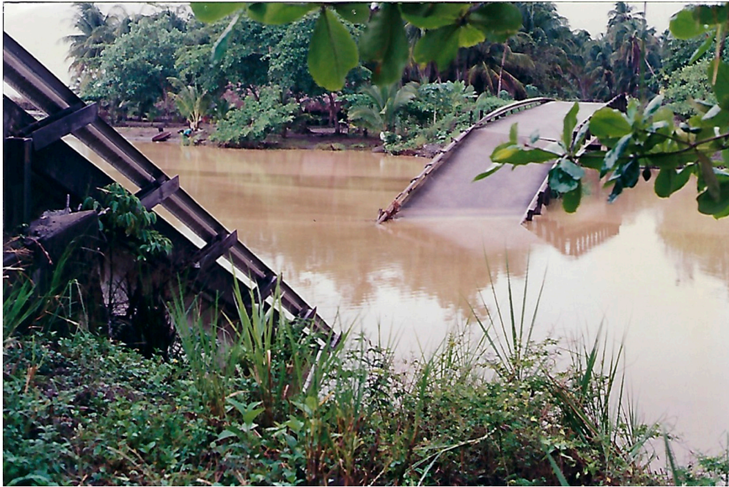
Fig. 8: Damage to the Vizcaya River bridge, 10 km south of Limón, due to soil liquefaction and lateral spreading.