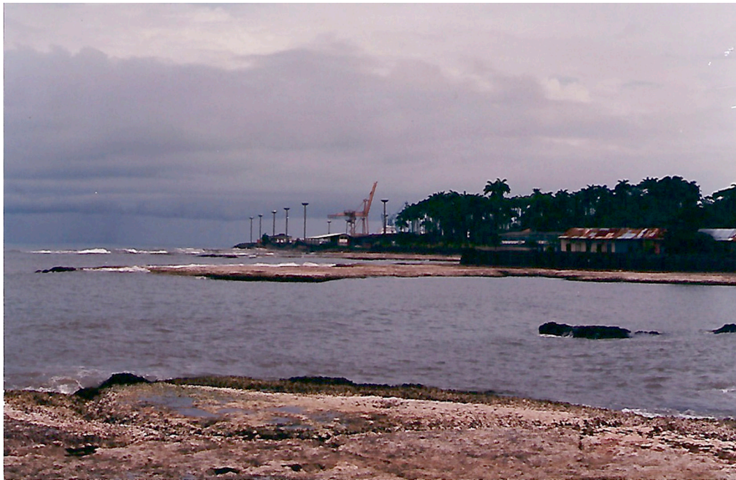
Fig. 7: Coseismic coastal uplift near Limón City, Costa Rica.