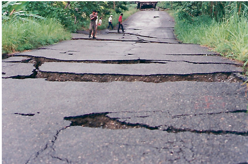
Fig. 9: Road damage on the Vizcaya River bridge approach due to liquefaction and lateral spreading.