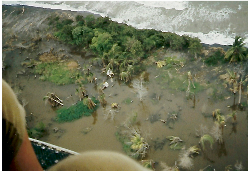
Fig. 4: Near vertical air photograph of an area flooded by the tsunami at Playa de Julio Abrego, Panama (site 15, Fig. 1). Note the onshore flooding and the NE-SW trend of fallen palm trees.