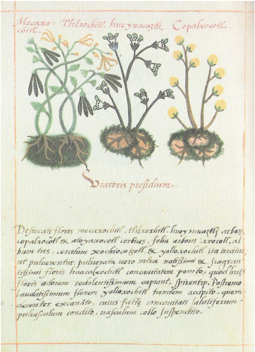
FIGURE 1. Page 56 verso. of Libellus Medicinalibus Indorum Herbis , the de la Cruz-Badiano Codex. The second plant (left to right) is tlilxochitl, Vanilla planifolia Andrews, the first depiction of a Mesoamerican orchid.