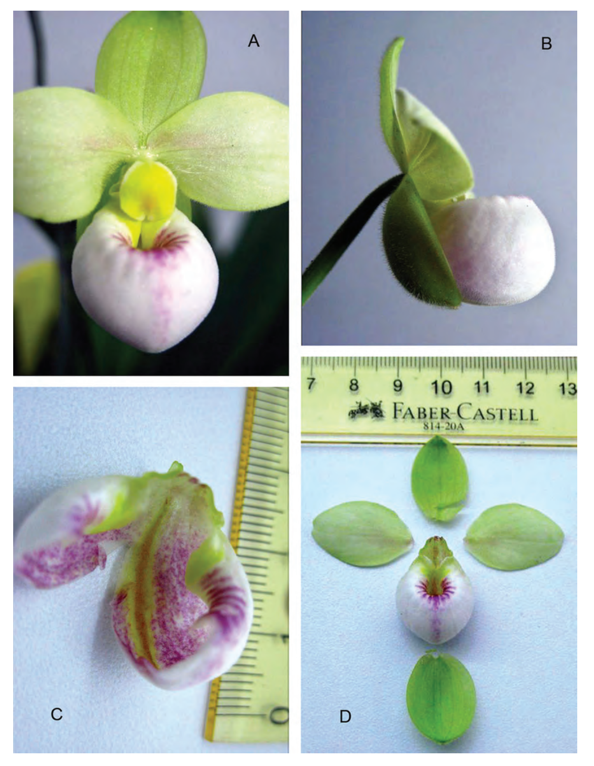
FIGURE 2. Phragmipedium manzurii W.E.Higgins & P.Viveros. A. Flower, frontal view. B. Flower, lateral view. C. Dissected pouch. D. Dissected flower.