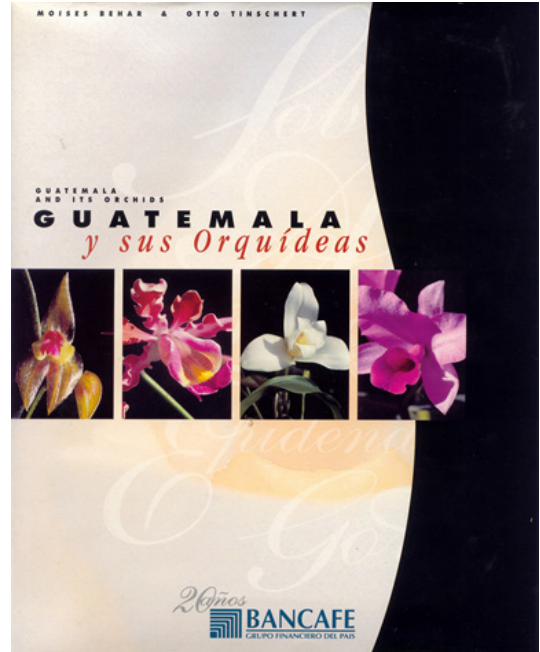
FIGURE 6. Guatemala and its Orchids – Front cover.