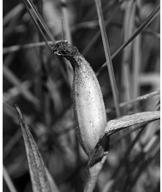
FIGURE 2. Cyripedium candidum developing ovary following successful pollination (Wake 2004).

Cyripedium candidum is not a shade tolerant plant and prefers open, wet, rich prairie meadows with alkaline soils and calcareous fens (Galbraith 1996). However, prairie habitats have been transformed by agricultural and urban development, through cropland expansion, extensive grazing, and wetland drainage.