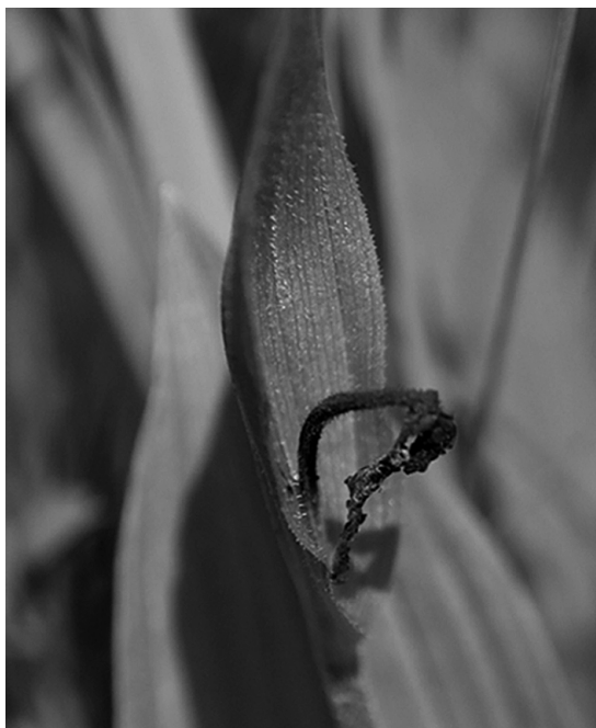
FIGURE 3. Cypripedium candidum senescing / aborting ovary tissue following no pollination (Wake 2004).