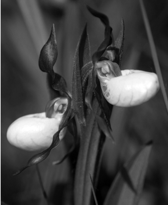
FIGURE 1. Cyripedium candidum (White Lady's Slipper) flower (Wake 2004).

around the pouch opening. The two lateral petals (4-5 cm), which are similar to the sepals, are pale yellow-greenish with lavender veins, pointed, and spirally twisted. The dorsal sepal (2-2.5 cm) is ovate to elliptical and the two lateral sepals are united nearly to the apex. The staminodes, ovate in shape, appear yellow with purple spots and are attached to the style and stigma forming the column. The stigma is borne on the lower side near the base of the column and the pollen is shed in bilateral waxy pollinia. The ovary is inferior, 3-celled, (Fig. 2) and matures into an ellipsoid dehiscent capsule. The seeds are very numerous and minute in size. Cyripedium candidum are thought to be pollinated by adrenid and halictid bees (Catling and Knerer 1980).