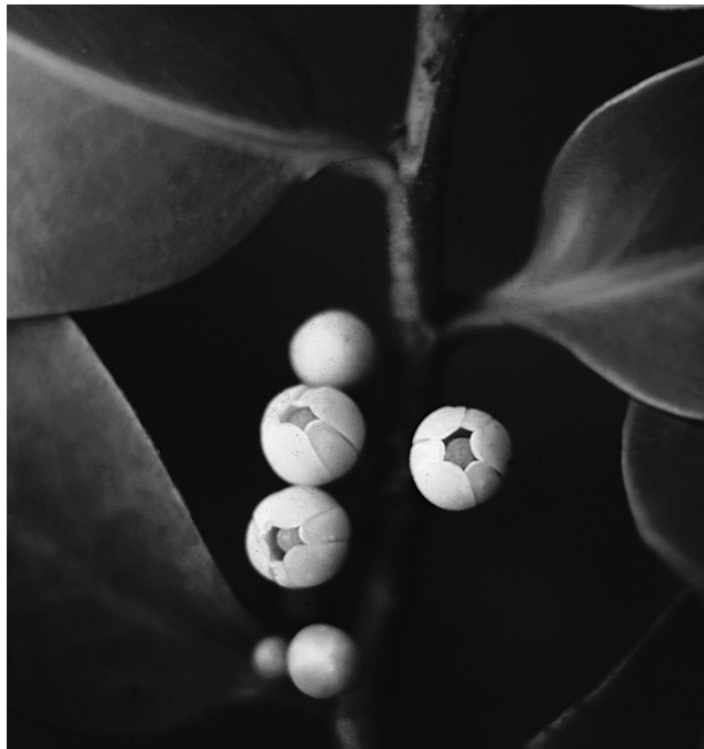
Fig. 2. Pleodendron costaricense N. Zamora, Hammel & R. Aguilar. Branch with mature flowers seen from above. (Photo from type gathering, Zamora et al. 2986, by R. Aguilar.)