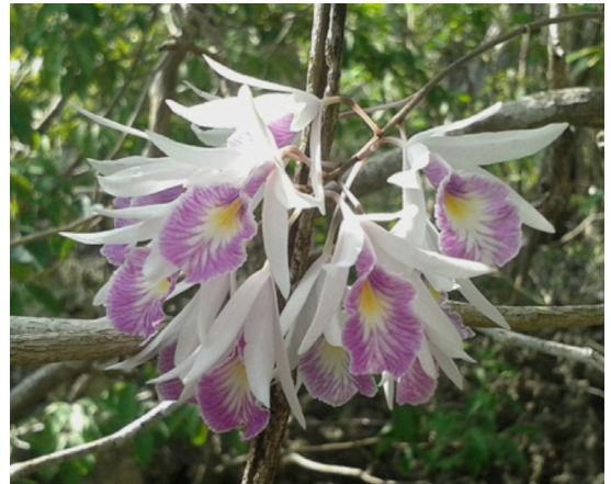
FIGURE 3. Broughtonia × guanahacabibensis , nothosp. nov.

Broughtonia cubensis (Lindl.) Cogn. × Broughtonia ortgiesiana (Rehb.f.) Dressler.