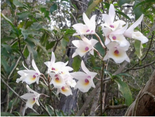
FIGURE 1. Broughtonia cubensis at Cabo San Antonio.