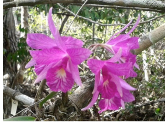
Figure 2. Broughtonia ortgiesiana , the first record of this species at Cabo San Antonio.

eventual natural cross-pollination given their overlap in anthesis and geographic location. Evidence for sympatry is not limited to our 2004 observation. In January 2015, both species flowered concurrently again, with a second B. ortgiesiana yielding six flowers. Further exploration of this site revealed five individual orchids with intermediate floral characteristics of both species (Fig. 3–4).