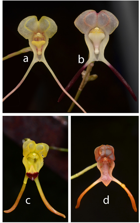
FIGURE 3. Flowers of four species of Porroglossum . A. P. aureum . B. P. raoi . C. P. marniae . D. P. olivaceum .

CONSERVATION STATUS: Because of its limited range of distribution and the risk of deforestation in the type locality, Porroglossum raoi should be considered as endangered or critically endangered by the IUCN criteria. Although it has not been found elsewhere, hopefully a healthy population of P. raoi thrives inside Dracula Reserve of the Ecominga Foundation, which exists close to where this species has been discovered.