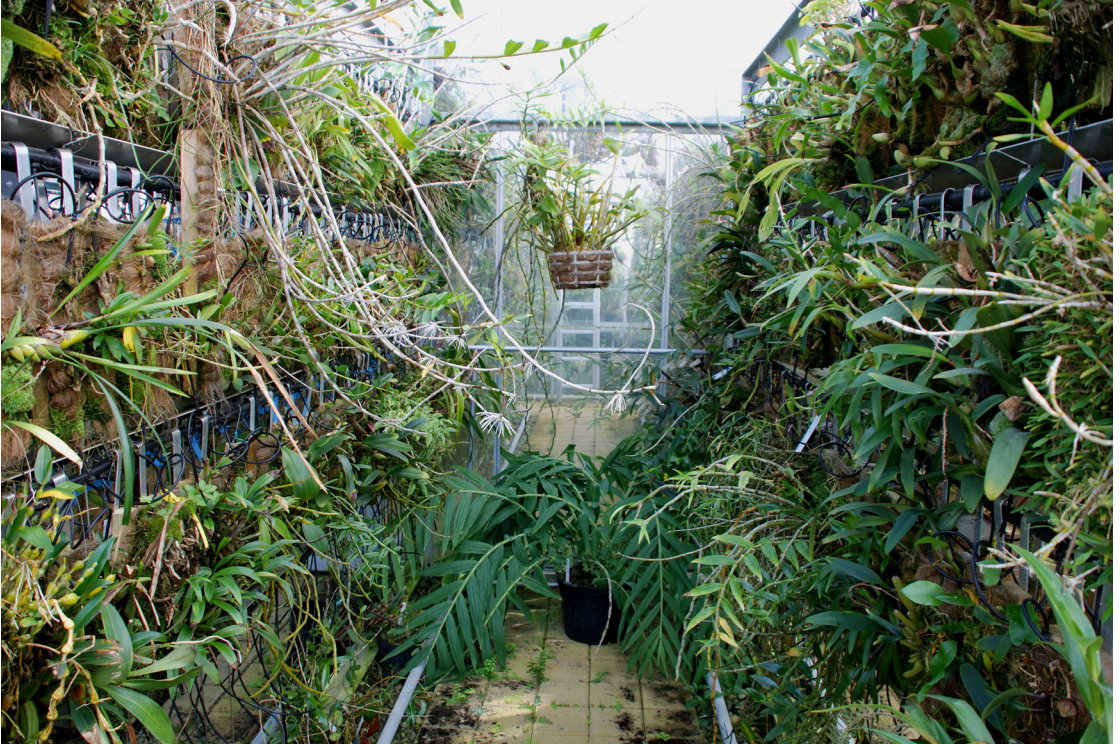
FIGURE 1. The Seidenfaden collection anno 2014 – accommodated in a modern greenhouse donated by the Augustinus Foundation in 2000.

of Copenhagen, around 1959 when Seidenfaden was posted to Moscow as Danish ambassador to the Soviet Union. Upon his return to Denmark in 1961, he was able to resume expedition activities during recurrent visits to Thailand. Consequently, the living collection kept growing until Seidenfaden's last expedition in 1983.