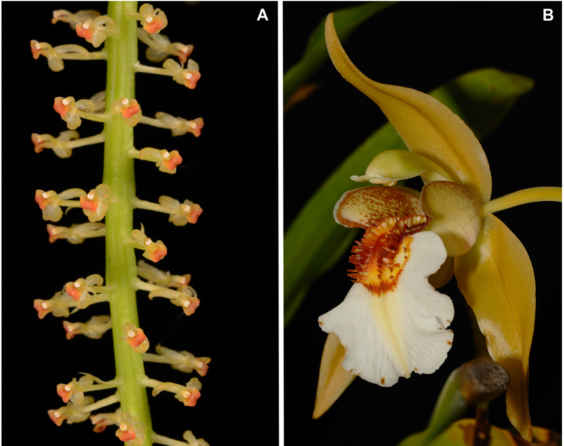
FIGURE 2. The two latest examples of new national records for Thailand revealed in Seidenfaden's living collection; both species are obvious candidates for inclusion in the next edition of the national Thai red-list. A. Liparis vestita Rchb.f. – in Thailand only known from Amphoe Rong Kwang in Phrae and from two sites in Khao Yai National Park (Nakhon Nayok, Prachin Buri). B. Coelogyne lawrenceana Rolfe – in Thailand only known through a single plant collected on Doi Inthanon (Chiang Mai) in 1978.

samples for their phylogenetic studies. However, sampling was standardized considerably in our recent project, as we decided to DNA barcode as many of the identified species as funding would allow. For this purpose, we adopted the officially recommended core-barcode for land plants, supplemented by ITS. We sampled a total of 131 species from the collection, and the prepared barcodes will be made publicly available as soon as possible.