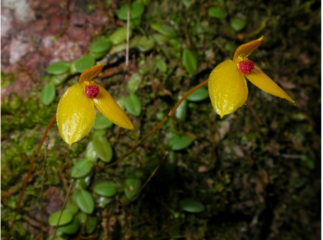
FIGURE 3. Bulbophyllum catenarium Ridl. (Vermeulen 4329, Malaysia, Sabah, Crocker Range, G. Alab, 2000 m a.s.l.).

which do not usually bear leaves in flowering season. However, B. ovalifolium has slightly inclined ovate bulbs usually bearing leaves while flowering. Labellum in B. moniliforme has smooth surface bearing very inconspicuous side lobes, however it is rough or warted on the upper surface in B. ovalifolium with very distinct side lobes.