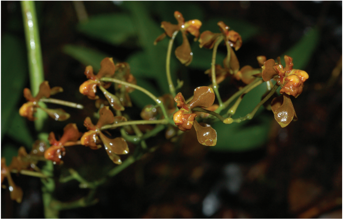
FIGURE 2. Cyrtochilum flexuosum , from Cali in Colombia, the second of the two generitypes for the genus.

groups. This method will create visually identifiable monophyletic genera, meaning that all species in each group/clade/branch have evolved from the same ancestor. At the same time this presents natural groups of plants that share certain features that visually distinguish them from other groups. But this method has some challenges as well. Nature follows its own rules, which sometimes can appear whimsical and frequently allows not closely related plants to develop flowers that look similar because they target the same pollinators. Similarly, plants that are closely related and grow together may display very different-looking flowers because they are targeting different pollinators. When we place species together based on floral similarities alone without respecting the genetic background, we risk creating polyphyletic groups with ancestors that come from unrelated backgrounds. This has happened a lot within the C-O-O complex and is a major reason why there are still considerable disagreements among taxonomists about how to treat this group. To include some complexes of plants that molecular evidence show belong together in a monophyletic Cyrtochilum (Williams et al. 2001, Pridgeon et al. 2009, Szlachetko