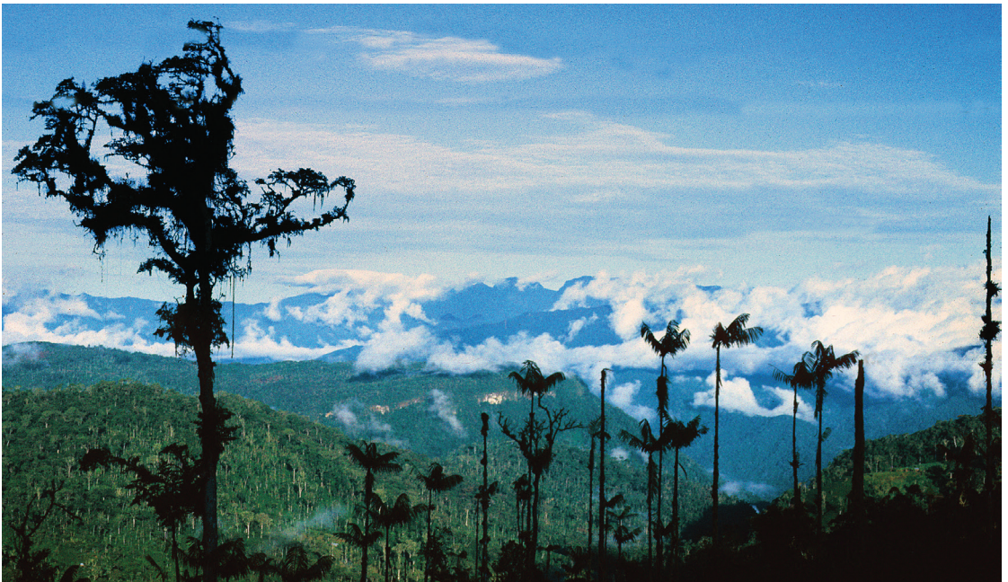
FIGURE 6. The isolated Condor mountain range in Ecuador, as seen from a position near the town of Gualaquiza.

Discussion. Cyrtochilum gentryi is a very interesting species that share morphological features from several different species complexes in the genus, which have been treated as separate genera by some (Königer & Schildhauer 1994, Königer 1996, Senghas 1997, Szlachetko et al. 2017). The growth habit with a creeping and bracteate rhizome is similar to that of species in the C. undulatum and C. flexuosum (the latter as genus Trigonochilum Königer & Schildh.) complexes, thus displaying typical Cyrtochilum sensu stricto features (Kunth 1816), but also to the C. auropurpureum complex (genus Odontoglossum fide Bockemühl 1989, Szlachetko et al. 2017). The flower of C. gentryi , on the other hand, is morphologically close to those in the C. myanthum complex (genus Dasyglossum Königer & Schildh.) with a column that