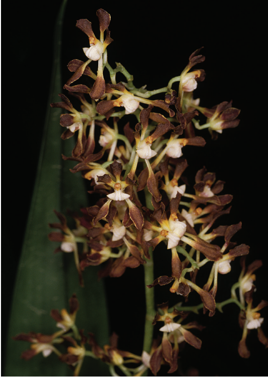
FIGURE 5. Cyrtochilum myanthum , from Ecuador.

on the upper plateau of the Cordillera del Cóndor in Ecuador (Fig. 6), growing terrestrially in a “tepui-like bromeliad sward with scattered small trees”.