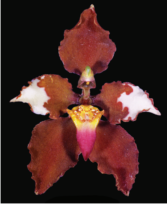
FIGURE 1. Cyrtochilum undulatum (syn. C. ventilabrum (Rchb.f.) Kraenzl.), one of two generitypes for the genus.

groups. This method will create visually identifiable monophyletic genera, meaning that all species in each group/clade/branch have evolved from the same ancestor. At the same time this presents natural groups of plants that share certain features that visually distinguish them from other groups. But this method has some challenges as well. Nature follows its own rules, which sometimes can appear whimsical and frequently allows not closely related plants to develop flowers that look similar because they target the same pollinators. Similarly, plants that are closely related and grow together may display very different-looking flowers because they are targeting different pollinators. When we place species together based on floral similarities alone without respecting the genetic background, we risk creating polyphyletic groups with ancestors that come from unrelated backgrounds. This has happened a lot within the C-O-O complex and is a major reason why there are still considerable disagreements among taxonomists about how to treat this group. To include some complexes of plants that molecular evidence show belong together in a monophyletic Cyrtochilum (Williams et al. 2001, Pridgeon et al. 2009, Szlachetko