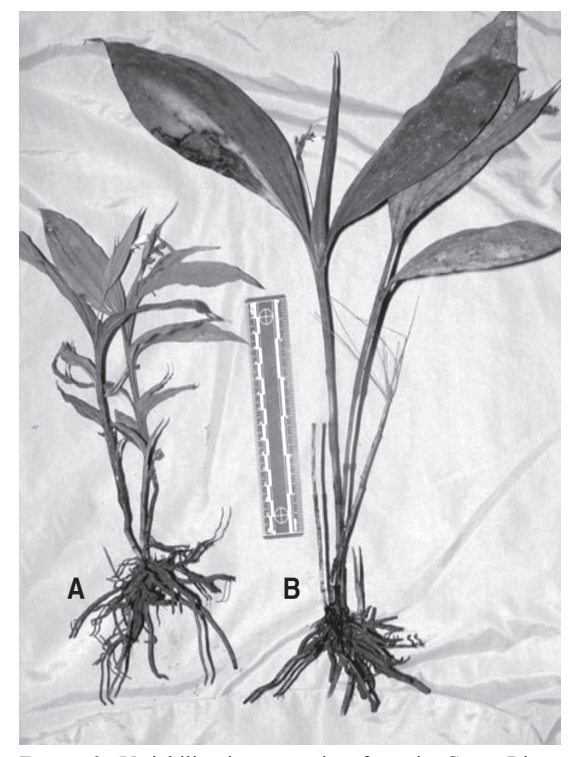
FIGURE 2. Variability in vegetative form in Costa Rican plants of P. nitida . A – The more common and compact form, similar to that of P. silvicola . B – The less common more elongated form, similar to that of P. trilobulata . 2006.

Bainbridge 263, Example A: 23 Jul 2006, 13 Aug 2006, 27 Aug 2006, 17 Sept 2006, 20 Oct 2006, 18 Nov 2006.