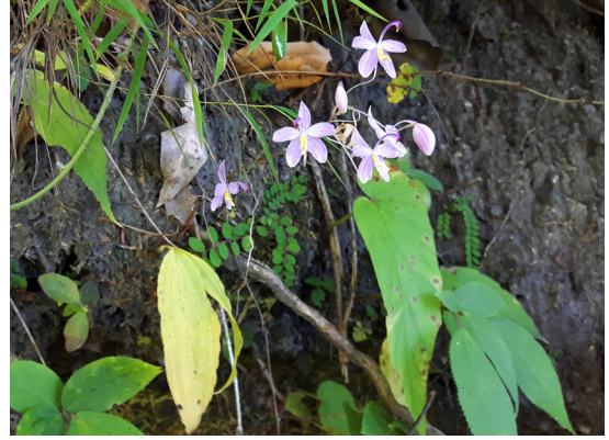
FIGURE 4. Natural habitat of Spathoglottis jetsunae in Zhemgang.

limestone outcrops together with P. fairrieanum . At this site only a single Spathoglottis plant was seen; in a larger population of the Paphiopedilum . Additional studies are desirable to achieve a better understanding of the natural distribution, occurrence and threats to this newly discovered and hence, little known Spathoglottis .