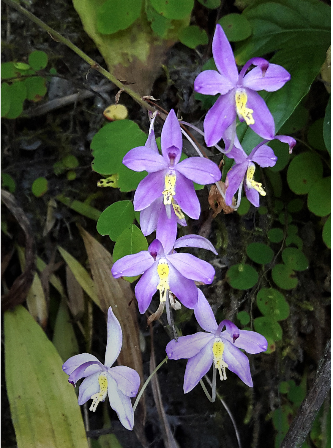
FIGURE 5. The striking flowers of Spathoglottis jetsunae .