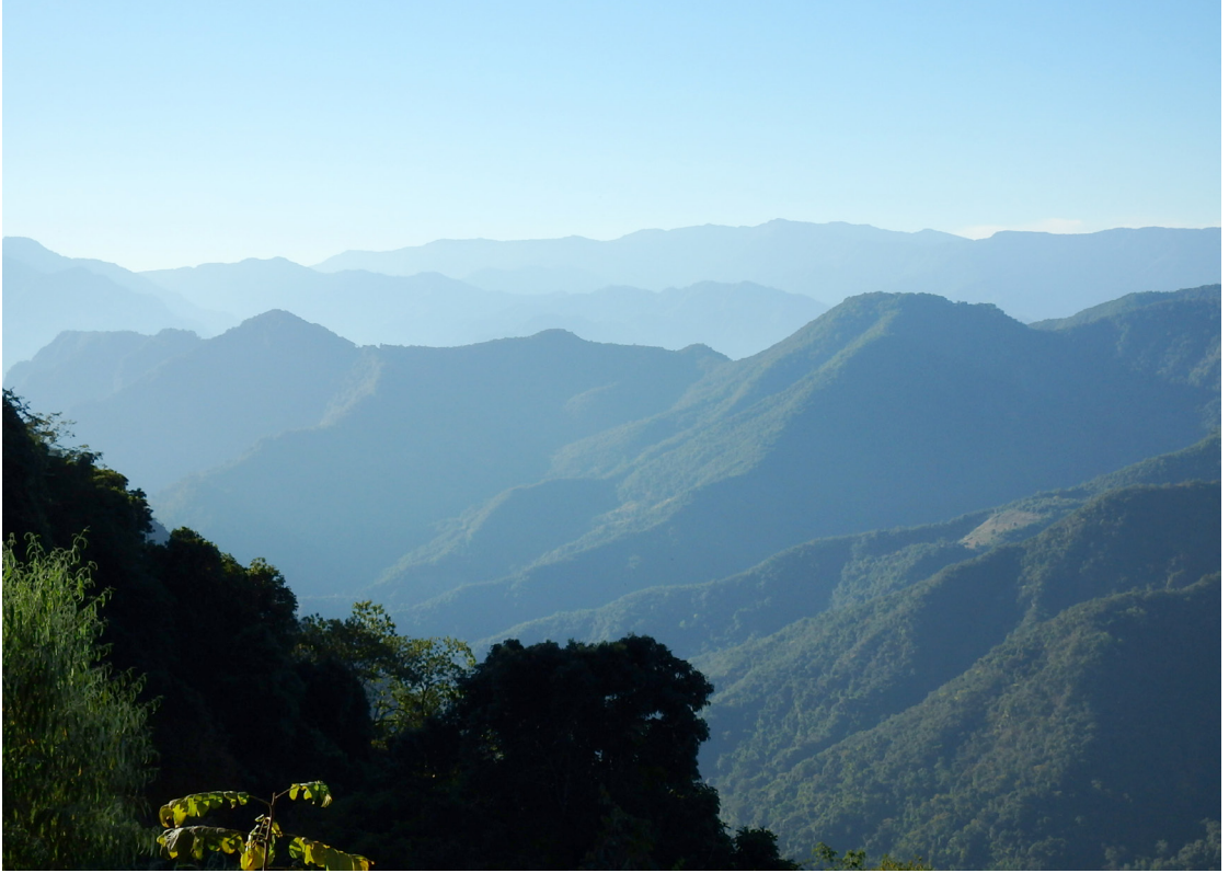
FIGURE 1. The mountains of southern Zhemgang are vast and difficult to explore.