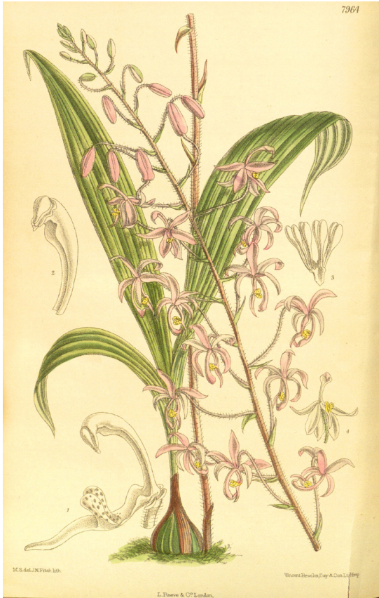
FIGURE 7. Spathoglottis hardingiana from the Curtis' Botanical Magazine , plate 7964 (1904).

of the callus, front-lobe reduced to a coiled-up, ca. 6 mm long narrow strap-like structure, callus of a pair of basally pubescent spreading fleshy lobes, with an additional erect and parallel pair of ca. 5.8–6.0 mm long digitate, or “sausage-shaped”, structures; column slender, erect and gradually arcuate, narrowly winged throughout and becoming broader towards the apex, ca. 14 mm long; anther campanulate, pyriform in upper view, dorsally indistinctly lobulate; pollinarium of two sets of four elongate, clavate ca. 2.0–2.3 mm long pollinia. Capsule not seen.