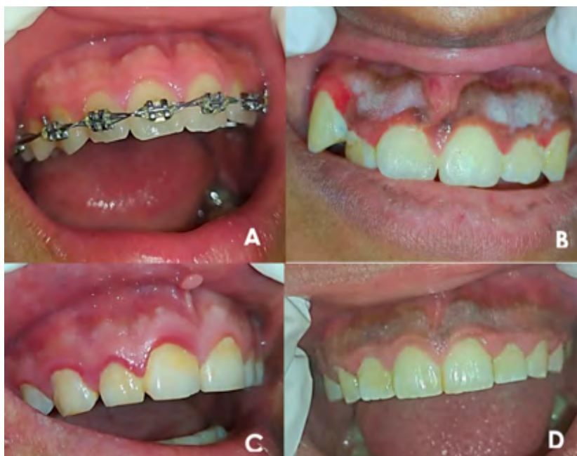
Figure 2. Clinical images of gingival papillokeratosis with crypt formation (IGPCF) observed in patients. A) An 18-year-old male patient with no relevant personal pathological history. He reports no known allergies or current pharmacotherapy. Currently undergoing orthodontic treatment. B) An 18-year-old female patient, systemically healthy, who denies a history of allergies and medication use. C) A 29-year-old male patient with a history of Human Papillomavirus (HPV) infection. He reports an allergy to apples and habitual alcohol consumption. D) A 25-year-old male patient who reports a diagnosis of gastritis and is under treatment with omeprazole. He presents with a history of substance abuse, including tobacco, alcohol, and cannabis (marijuana and CBD) use.