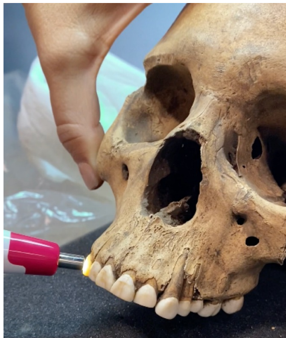
Figure 4. Complete skull from the C-27HM collection measured with Vita Easy Shade V.