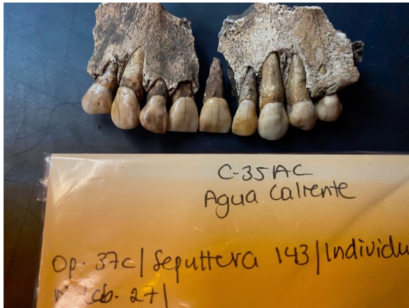
Figure 5. Nine dental pieces from the same individual in the C-35AC collection, where the condition of the teeth and lesions on both teeth and bone can be observed. The classification assigned by the archaeologist in charge is visible.