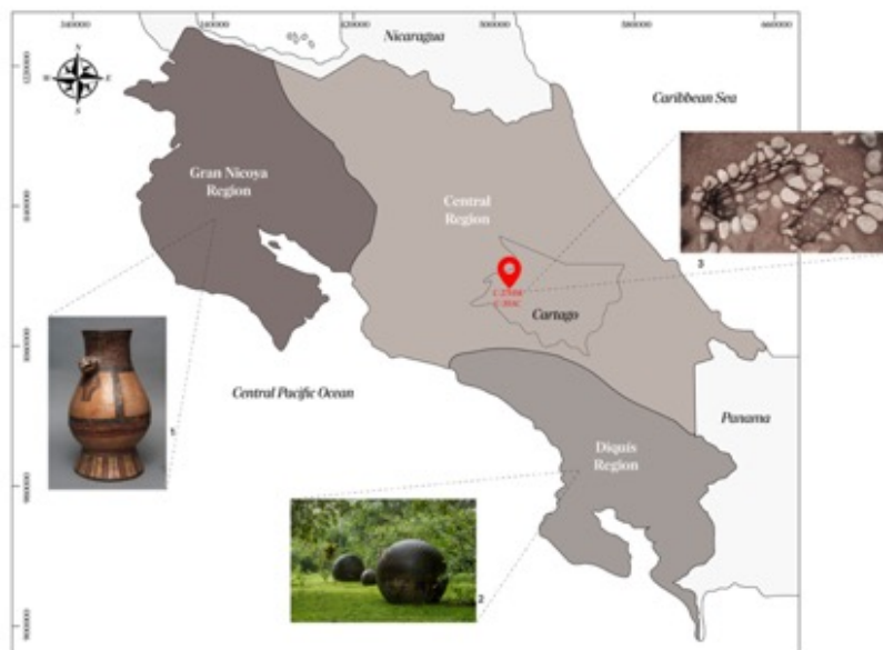
Figure 1. Three geographic-temporal zones: Gran Nicoya, Central Archaeological Region (CAR), which includes a) Curridabat Phase (300 AD-700 AD), b) Transitional Phase (700 AD-1200 AD), c) Cartago Phase (900 AD-1550 AD), and Diquís region (38-40). Image created by L.A. Oruga.