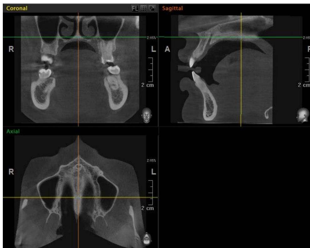
Figure 1. Image of standardization of the orientation of the tomographic volume to obtain the axial section to be evaluated. The position of the cursor in the coronal, sagittal and axial planes is observed.

Data were analyzed using SPSS v27. Descriptive statistics (mean, standard deviation, frequencies, and percentages) were calculated. Normality was assessed with the Kolmogorov-Smirnov test, which showed a non-normal distribution. Consequently, Spearman's rank correlation was applied, a non-parametric test suitable for ordinal or non-normally distributed variables. A significance level of 5% ( p < 0.05 ) was adopted.