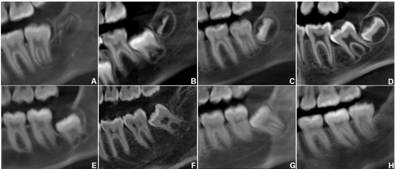
Figure 3. Demirjian et al. classification for mandibular molar mineralization in TCCB: A, onset of calcification; B, smelting mineralized cusps; C, crown halfway; D, crown completed; E, short roots; F, longer roots with open apices; G, apices almost closed; H, closed apices.