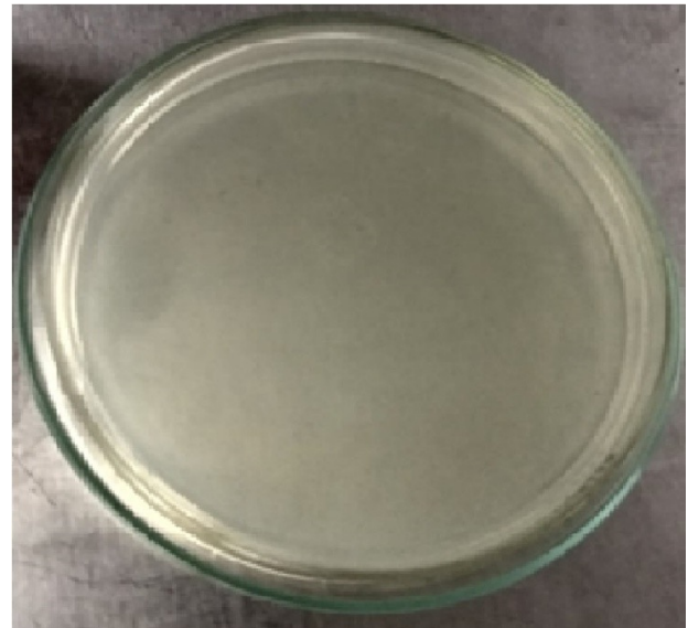
Figure 3. Minimum Bactericidal Concentration (MBC) of Smear Clear® at 100% concentration.