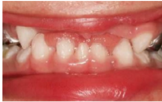
Figure 2. Occlusal image.