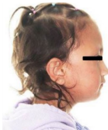
Figure 1. Profile image. Patient with a convex profile.

caries and anterior tooth loss due to decay, resulting in an unstable occlusion and a mesial step molar relationship on the left side (Figure 2 and Figure 3). The panoramic radiograph showed that the patient was in the primary dentition stage, with the ongoing formation of permanent tooth germs (Figure 4). Physical examination revealed ectrodactyly, multiple hypopigmented atrophic plaques on the left lateral trunk following the lines of Blaschko, syndactyly, anonychia, nail dystrophy, and papules in the perioral region (Figure 5). Comprehensive pediatric dental treatment was carried out, including protective stabilization with prior authorization from the mother, due to the patient's definitively negative behavior, extensive treatment needs, and young age. The treatment included biofilm management, pulpal therapies on primary teeth, basic and advanced restorative procedures, multiple extractions, and maxillary management using a modified Hawley appliance with an esthetic anterior segment (Figure 6). At the end of the treatment, self-care instructions were provided, understood, and accepted by the caregiver. The patient remains under ongoing follow-up.