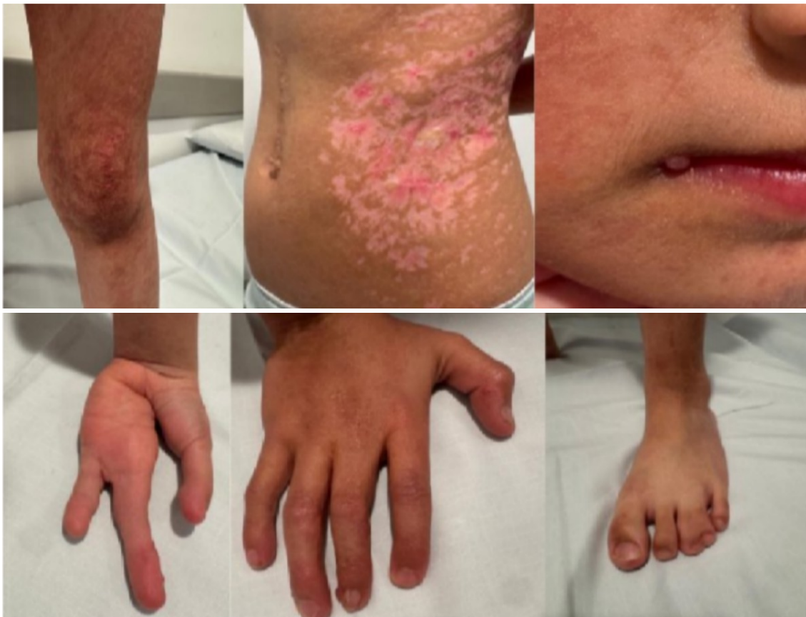
Figure 5. Body images.