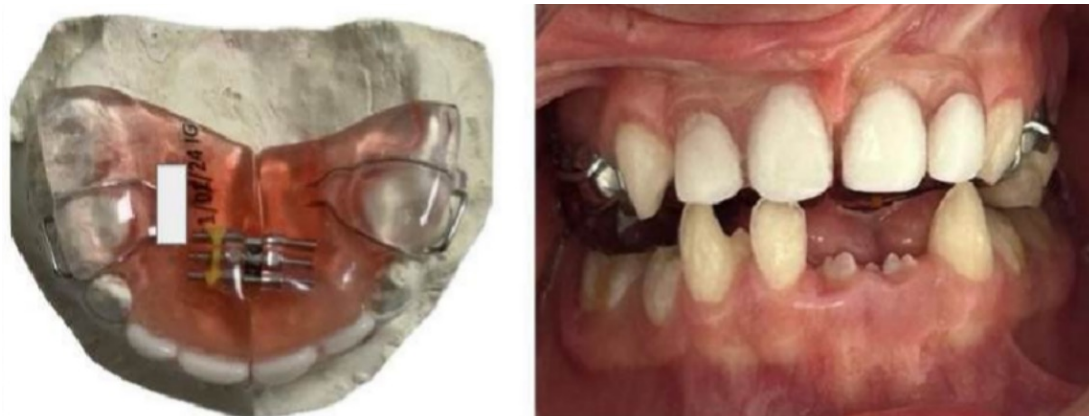
Figure 6. Dentofacial orthopedics with modified Hawley appliance with an esthetic anterior segment.