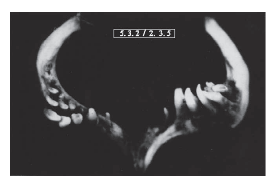
Fig. 5. Pharyngeal teeth of Barbus plebejus escherichi Steindachner, 1897 (5+3+2/2+3+5).

We have specimens of B. capito capito which show a sharp nose in the segments of Coruh where the water flows faster, suggesting a modification related to the speed of the water current in the river.