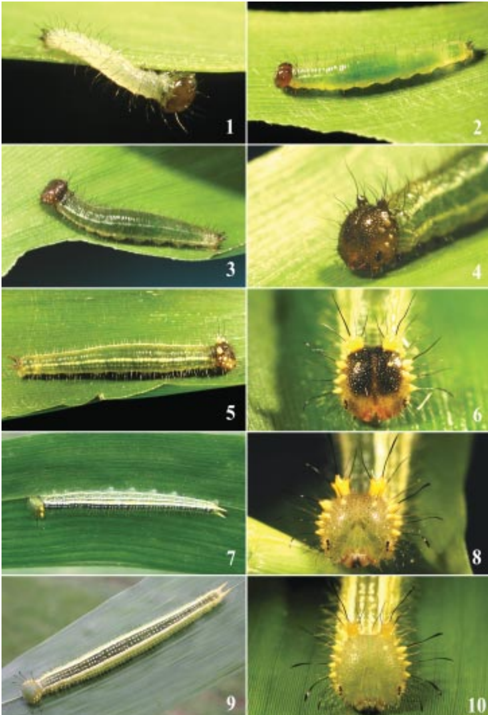
Figs. 1-10. Early stages of Manataria maculata : 1) recently hatched first instar (dorso-lateral view), 2) late first instar, 3) second instar, 4) head of second instar (frontal view), 5) third instar, 6) third instar head, 7) fourth instar in resting position, 8) fourth instar head, 9) fifth instar (dorsal view), 10) fifth instar head.