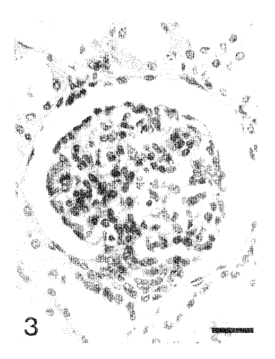
Fig. 3. Marked hyperplasia of the mesangial cells at the hilar zone. Hematoxilyn-Eosin. Bar = 50 \, \mu m .

Diagnosis: Extracapillary glomerulonephritis with global crescents.