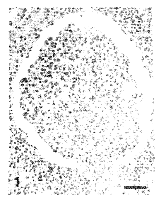
Fig. 1. Proliferative glomerulonephritis and periglomerular infiltrate composed by monomorphonuclear cells. PAS. Bar = 75 \mu m .

Diagnosis: Acute proliferative diffuse glomerulonephritis and chronic interstitial nephritis.