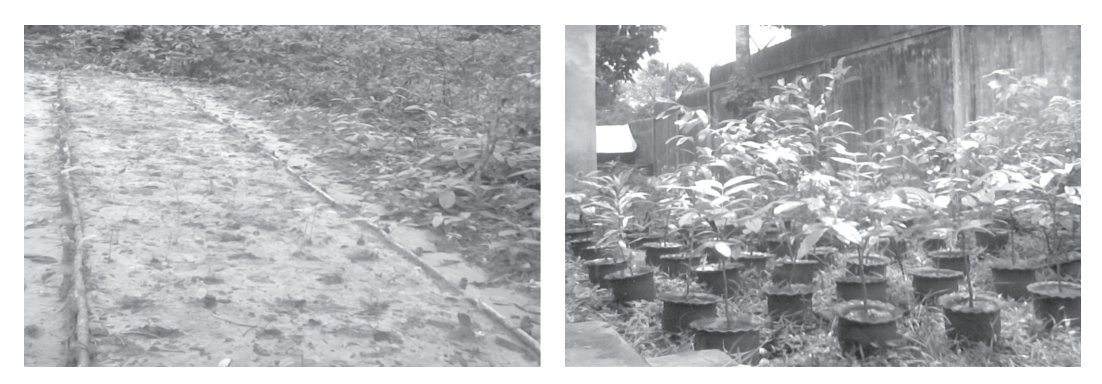
Fig. 1. Germination test (left side) and growth performance assessment by pot culture (right side) on natural forest soil and deforested soil at Dulahazara, Bangladesh.

S. grande were raised in earthen pots in Dulhazara Safari Park. These species were chosen for the experiment because they are normally found in plantation forests in this region. For the experiment, soils were collected at a depth of 0-25cm from both natural forest and deforested land of Dulhazara Safari Park in 31 October, 2007. From each land use, five soil samples were collected randomly and mixed together to fill the pots. The earthen pots of diameter 25cm and height 30cm were used for the experiment. For each species five pots were filled with soils from natural forest and other five with deforested soil. Same sized seedlings of one and half month aged were uprooted from the experimental seedbeds of germination and directly planted on each of the pots in October 31, 2007. Pots with forest soils were kept within the Safari Park and pots with deforested soils were set up in the adjacent deforested land. Watering was done in a controlled way to avoid the leaching out of nutrients from the soil.