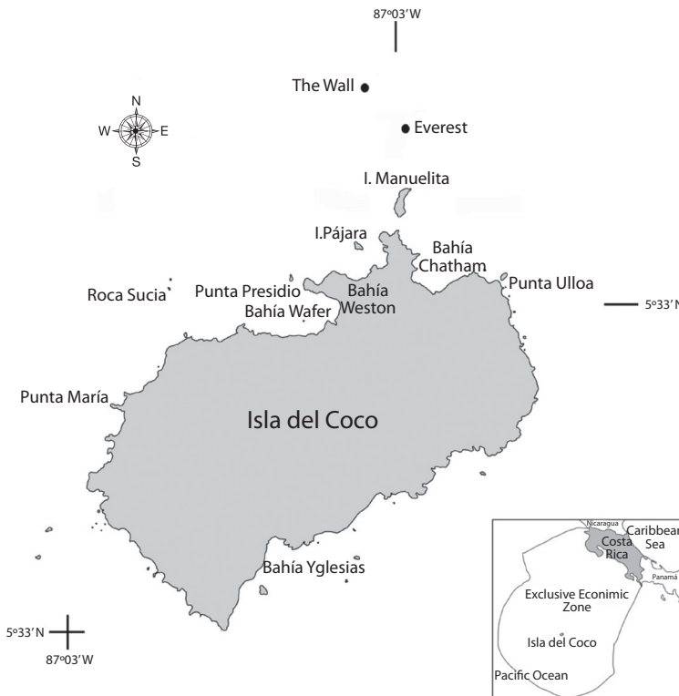
Fig. 1. Collecting sites at Isla del Coco National Park.

Study site: Isla del Coco National Park (5°30'–5°34' N - 87°01'–87°06' W) is located approximately 550 km southwest of Cabo Blanco, Costa Rica, and about 630 km northeast of the Galápagos Islands (Lizano, 2001) (Fig. 1). The Island is the only point above sea level of the Coco Volcanic Cordillera