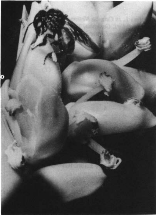
Fig. 3. Trigona fulviventris (Apidae) feeding on pollen from anthers of the male flower of Cocos nucifera . Pacuarito de Siquirres, Costa Rica, June 1985.