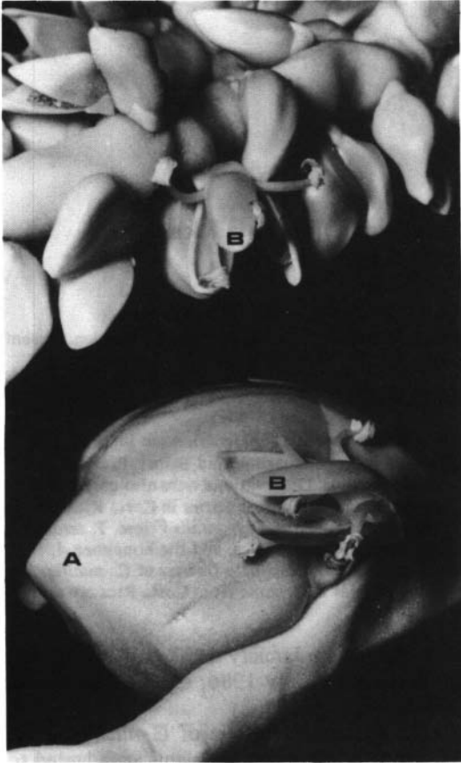
Fig. 1. The dimorphic flowers of Coccoloba nucifera . —A: Immature pistillate flower. —B: Newly opened staminate flowers. Cahuita National Park, Costa Rica, June 1985.

on June 15, 1985 (15:00-16:00 hours), along the Caribbean beach at Cahuita National Park (Fig. 2), by sitting perched at the height of the inflorescences of C. nucifera . The same method was utilized in Guayaquil and Cerecita, Province of Guayas, on the Pacific lowlands, on respectively November 11, 1986 (15:00-16:00) and November 12, 1986 (10:30-11:00 hours).