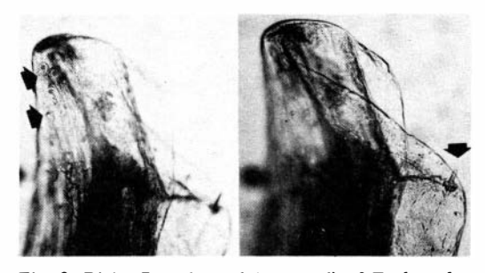
Fig. 2. Right first pleopod (gonopod) of Tyche sulae n.sp. a. Spine, b. Papillae.

Comparing these descriptions and drawings of the different gonopods of the known species, with those of Tyche sulae n.sp. (Figs. 2, and 3d), the general shape is straighter and not curved at the end. The crest flap has a strong and well-developed spine, directed forward on the anterior border, a structure not observed in the other gonopods. Dr. J.S. Garth (personal communication) examined the known species and could not detect spines on the flaps. The flaps do not cancel the genital orifice. We consider that these differences in the shape and