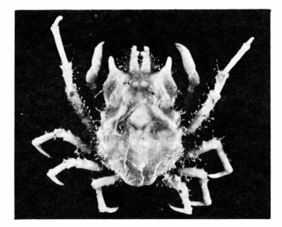
Fig. 1. Dorsal view of Tyche sulae, new species.

Padina. The holotype was captured with pieces of algae anchored in the hooked rostral and walking leg hairs, which permits the crab to camouflage itself with the substrate.