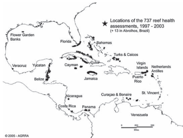
Fig. 1 AGRRA assessment sites during 1997-2003.

To overcome the inherent constraints of multiyear temporal variation, we envision a region-wide collaborative program in which reef assessments are conducted at regular