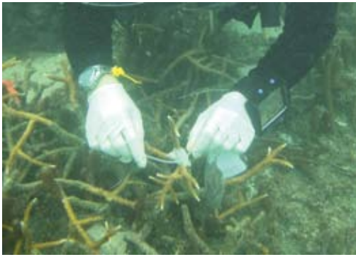
Fig. 1. Inoculation of bacterial strains into Acropora cervicornis branches.