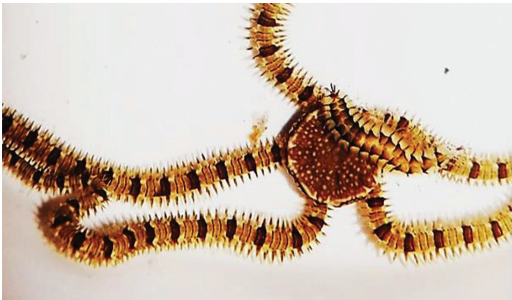
Fig. 2. Malmgreniella variegata and Ophionereis reticulata collected in Venezuela. Fig. 2. Malmgreniella variegata y Ophionereis reticulata recolectadas en Venezuela.

In this study 85 specimens of O. reticulata were collected and only two of these were