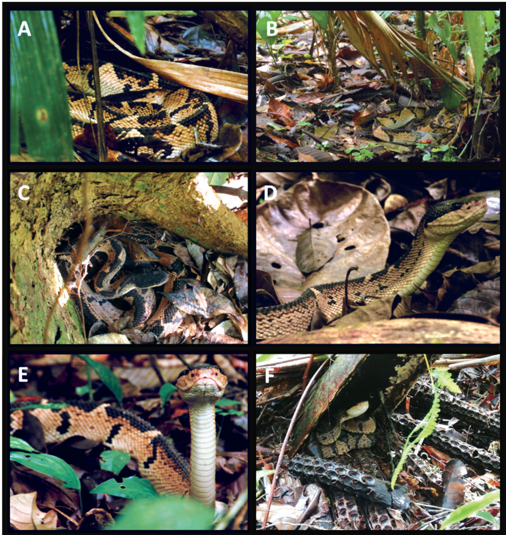
Fig. 2. Different resting sites for Lachesis melanocephala . (A, B, and F) Under palm leaves on the forest floor. (C) In tree buttress. (D, E) Periscopic displacement by raising the head. (A, B, C, D and E - Photos by Roel De Plecker; F - photo by Jacobo Mesén Sandoval).

July (De Plecker & Dwyer, 2020). Mating includes violent movements in which the male could knock the female off the ground with his coils (Ripa, 1994, Ripa, 2004). As seen in other vipers, the male first advances toward the female and rubs his chin in her dorsum. An unusual behavior, however, is that at some point, the male turns around and, with his back on top of her, venter upwards, begins with his own back to rub the female's back forward and