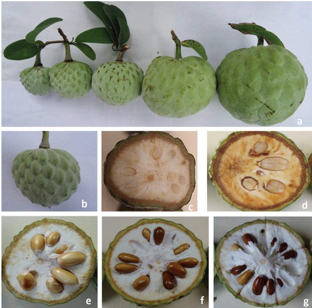
Fig. 1. Fruits in development. A. all stages of development, B-C. First stage (initial harvest, day 0), D. Second stage of development (day 15), E. Third stage (day 30), F. Fourth stage (day 45), G. Fifth stage (day 60).

The external appearance of the unripe seeds infected with larvae in the first instar was similar to the healthy seeds. Both infected and healthy seeds had the same color (dark brown 3/3 according to the Munsell color scale 2009) and did not show visible perforations in the seed coat. However, when dissected, active larvae were found, and the endosperm was partially destroyed by feeding activity (Fig. 3B, Fig. 3C).