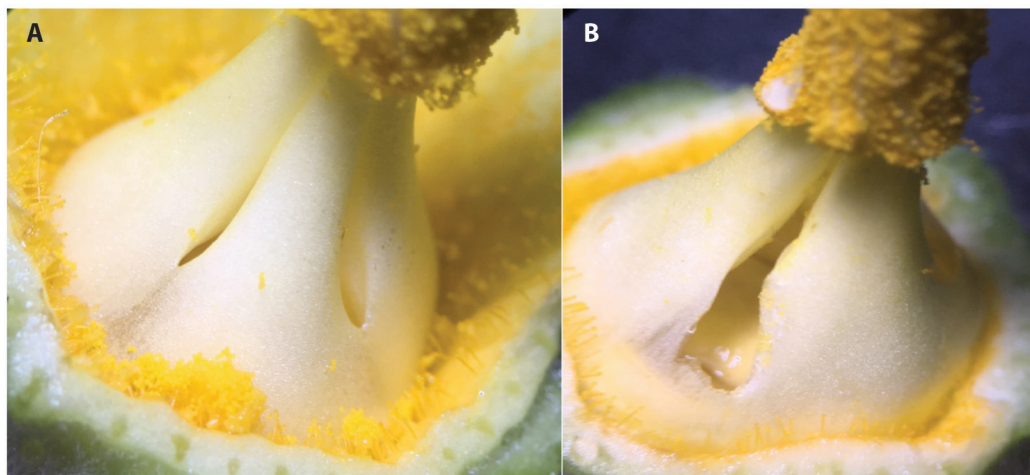
Fig. 3. Nectary pores in male C. pepo flowers. A. normal, B. enlarged by T. corvina bites.