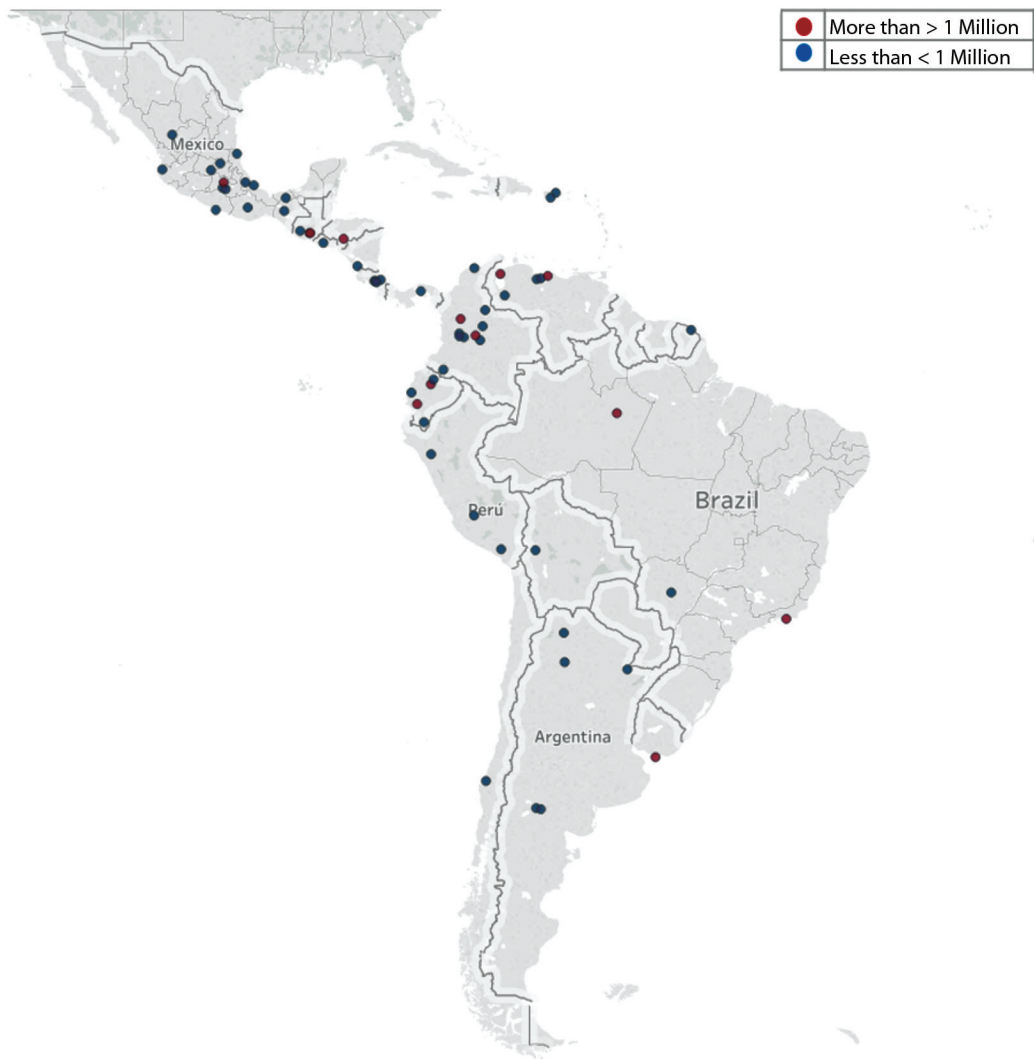
Fig. 1. Latin American cities (approximate location) included in our study, based on answers from survey participants. Support for research group EIS-UTP.