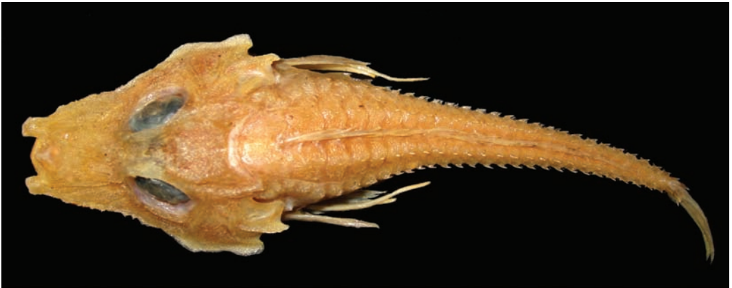
Fig. 2. Holotype of Peristedion nesium, n. sp., LACM 32265.003, 117.9mm from Isla del Coco, Costa Rica.