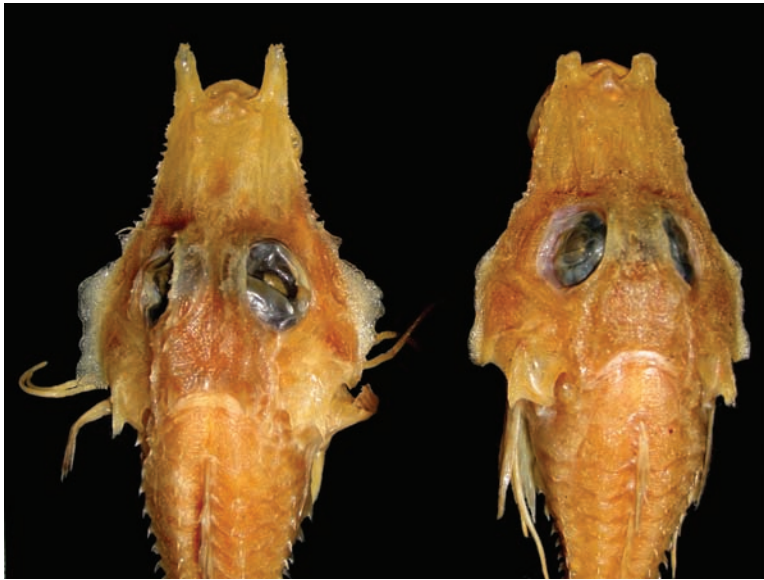
Fig. 3. Dorsal view of heads of Peristedion crustosum , LACM 20838, from Islas Galápagos (left side); holotype of Peristedion nesium , n. sp. from Isla del Coco (right side).