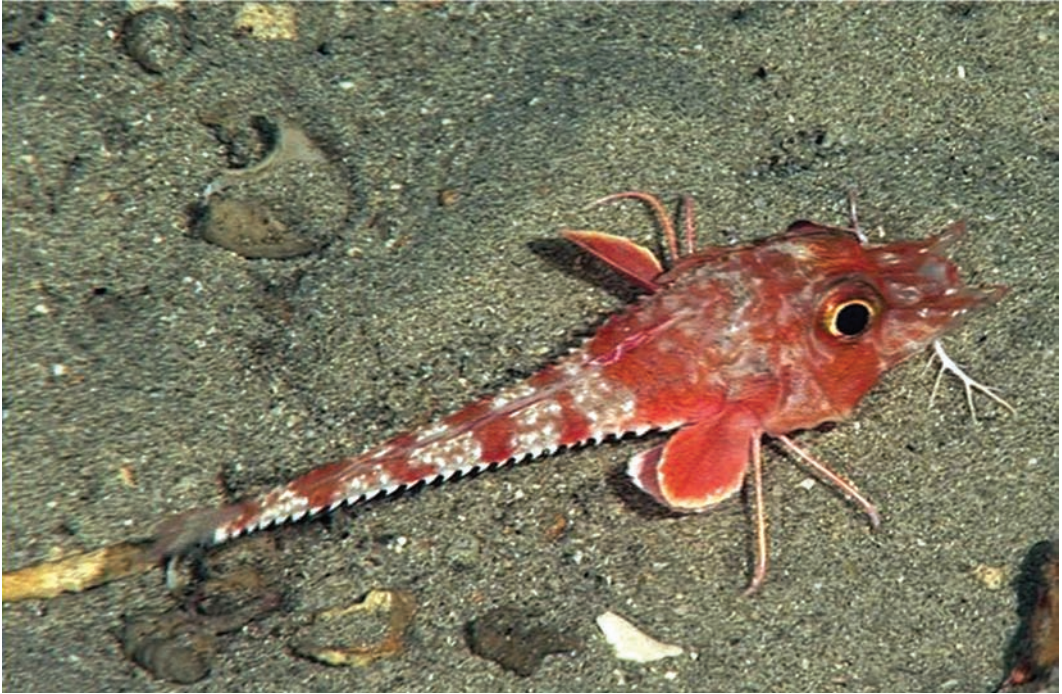
Fig. 1. Photograph of Peristedion nesium , n. sp. taken from a submersible at Isla del Coco, Costa Rica. Depth not recorded.