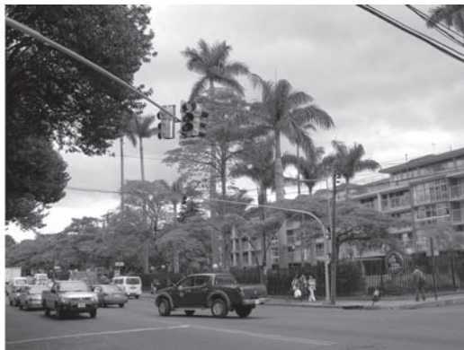
Fig. 1. Images used for the comparison: City of San José, Costa Rica. NOTE: The original images used in the measurements appear in the Internet edition.