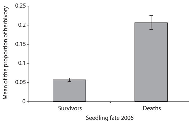
Fig 1. Seedling fate in 2006 as a function of herbivory in 2005. Seedling herbivory was measured in 2005 and the means of this were compared between two seedling conditions (alive or death) in 2006.

Figure 3 shows seedling height in 2006 as a function of its value in 2005 with coded symbols that represent the presence of spiders in panel A and for different intensities of arthropod herbivory in panel B. Spider presence correlated with higher growth rates represented by the code “S” clustered above the 45 degrees line, thus corroborating the correlation between spider presence and seedling growth (Table 1,2; Fig. 3A). In Fig. 3B it is clear that seedling growth correlated negatively with level of arthropod herbivory represented by the green “L” code clustered above the 45 degrees line. A decrease in seedling height is observed in seedlings with high arthropod herbivory, represented by the cluster of blue “H” codes (Table 1,2). The high degree of scattering suggests that for seedlings without herbivory growth did not depend on seedling height in the previous year – represented by the black “A” code.